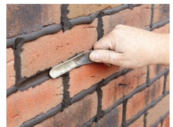
4. Mortar is tooled in the manner of traditional pointing.