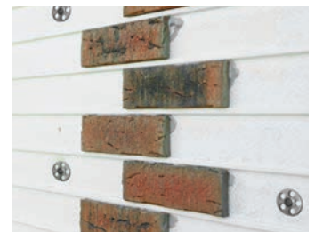
2. Brick slips are attached with permanent bonding adhesive.