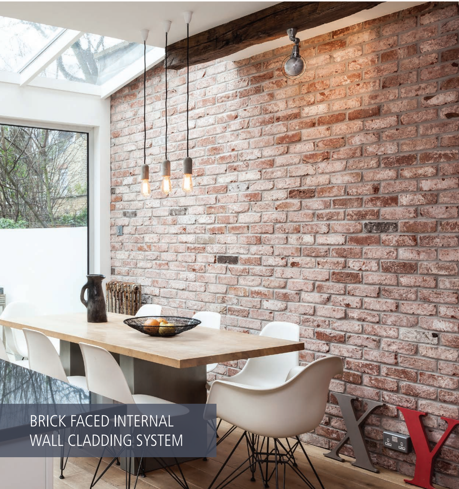
BRICK FACED INTERNAL WALL CLADDING SYSTEM