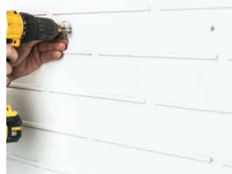
1. The ribbed backing panel is fixed to the substrate. (Fixings vary according to substrate.)

NB. Additional detail diagrams are available on our website or please refer to our Installation Guide. Please note that failure to fix in accordance with Eurobrick's instructions will invalidate the product guarantee.