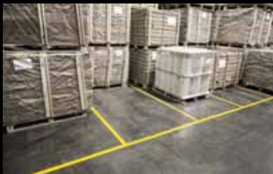
► Marking Tape / shipping zone