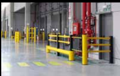
► TB Plus / fire equipment protection