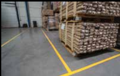
► Marking Tape / inspection area