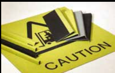
► Xtra Grip Plates, Stairsteps and Profiles