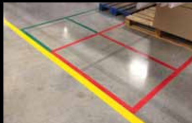
► Marking Tape / work zone