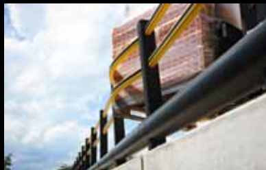
► TB Plus / loading dock fall protection