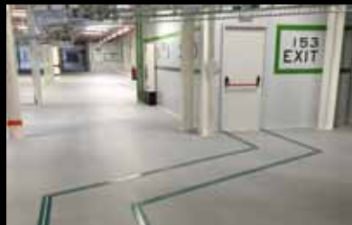
► Marking Tape Center / emergency exit