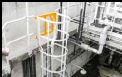
► Double Axes Gate / protect ladder opening