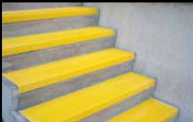
► Xtra Grip Stairsteps / stairs