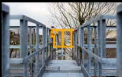
► Double Axes Gate / work platform protection