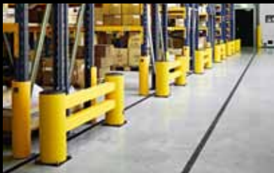
► Rack-end - RackBull / rack protection