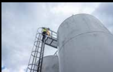
► Double Axes Gate / silo protection