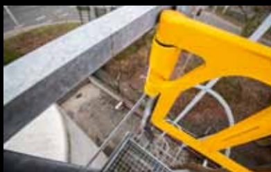
► Double Axes Gate / fall protection on height