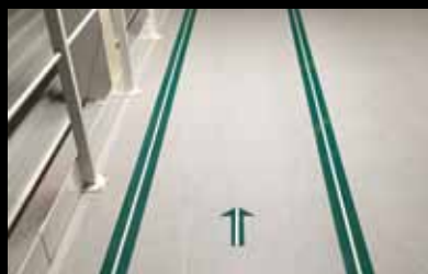
► Marking Tape Center - Sign / walkway