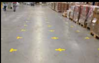
► Marking Tape L - T / receiving zone