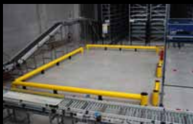
► TB 400 / conveyor belt protection