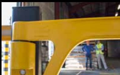
► Double Axes Gate / no sharp edges