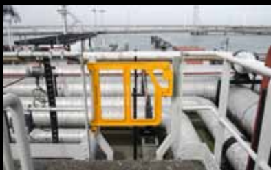
► Double Axes Gate / off-shore platform