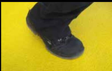
► Xtra Grip Boards / industrial floors