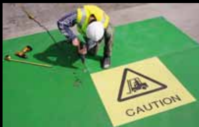
► Xtra Grip Boards / loading ramps