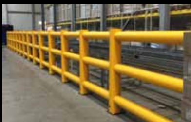
► TB Triple Super / machine protection