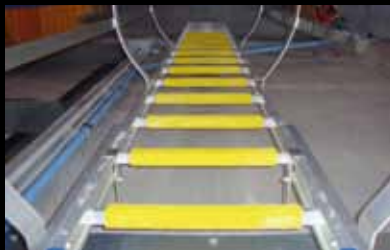
► Xtra Grip Profiles / access to machinery