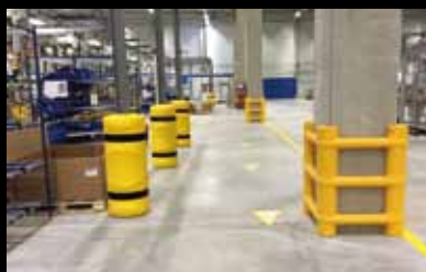
► KP Universal - KP 150 / column protection