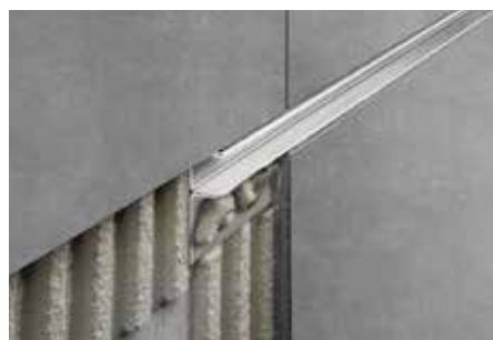
Installation as a shadow joint in the wall area