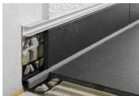
Installation in skirting