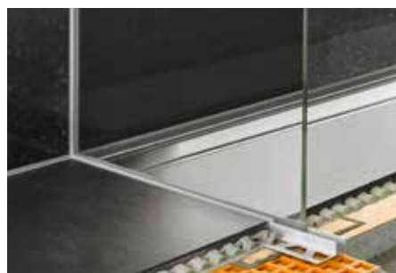
Installation in shower with glass element