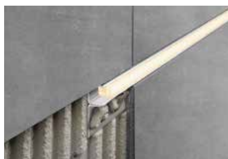
Installation as accent lighting with LED module LIPROTEC-LLPM

For this reason, remove adhesive or grouting material immediately from all visible areas and do not cover freshly installed coverings with foil. In addition, ensure that the profile is solidly embedded in the setting material to prevent water from accumulating in small cavities.