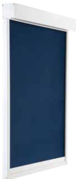
Cassette roller blind with side channels