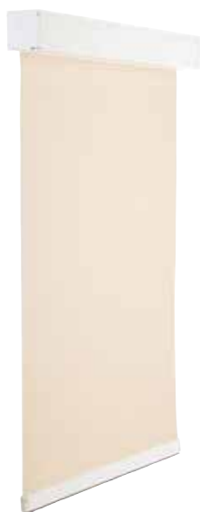
Cassette roller blind with no side channels