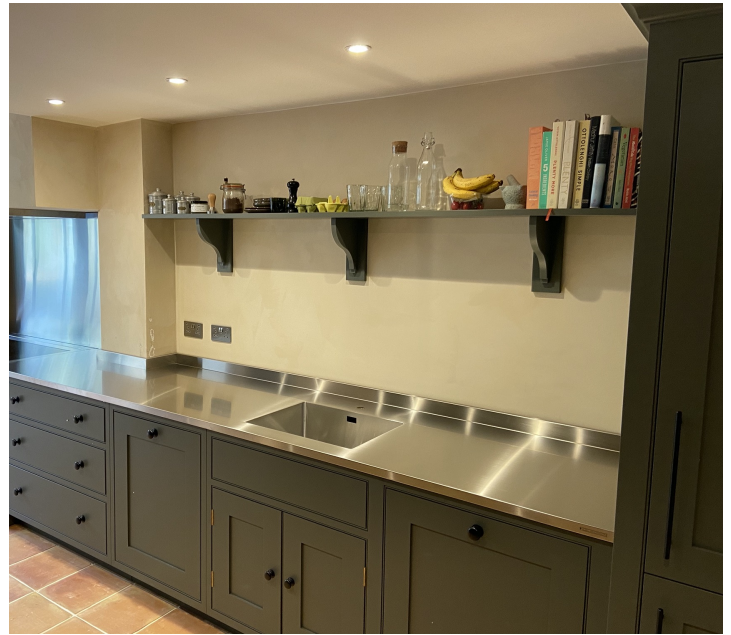
Galley kitchen worktop with integral sink and upstand

Room Type: Residential Kitchen Client: Private Individual