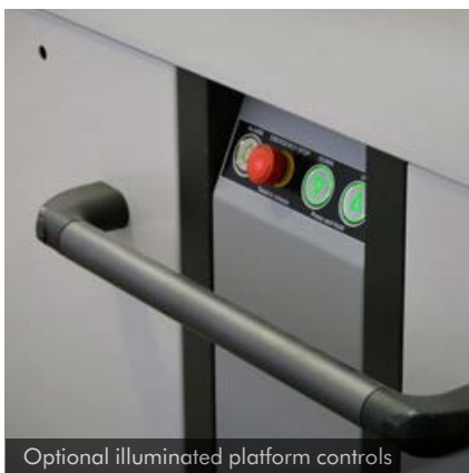
Optional illuminated platform controls