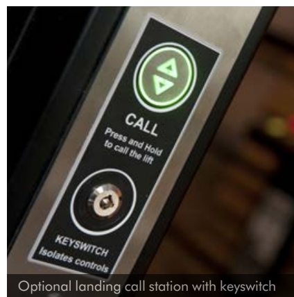
Optional landing call station with keyswitch