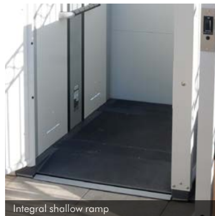
Integral shallow ramp