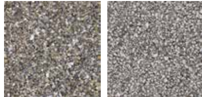
Guyanan Bauxite Footgrade, 1-3mm