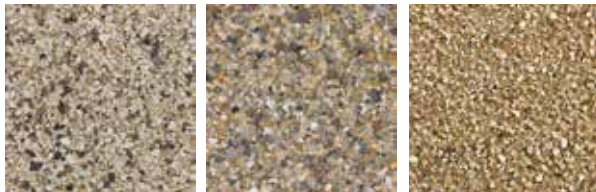
Chinese Bauxite Footgrade, 1-3mm