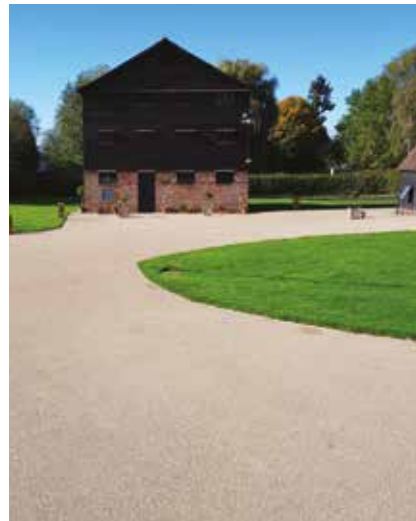
Silver Grey Granite 1-3mm,