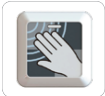
Sticker Option 1