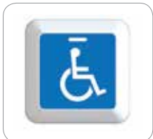
Sticker Option 2