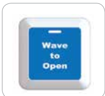
Sticker Option 3