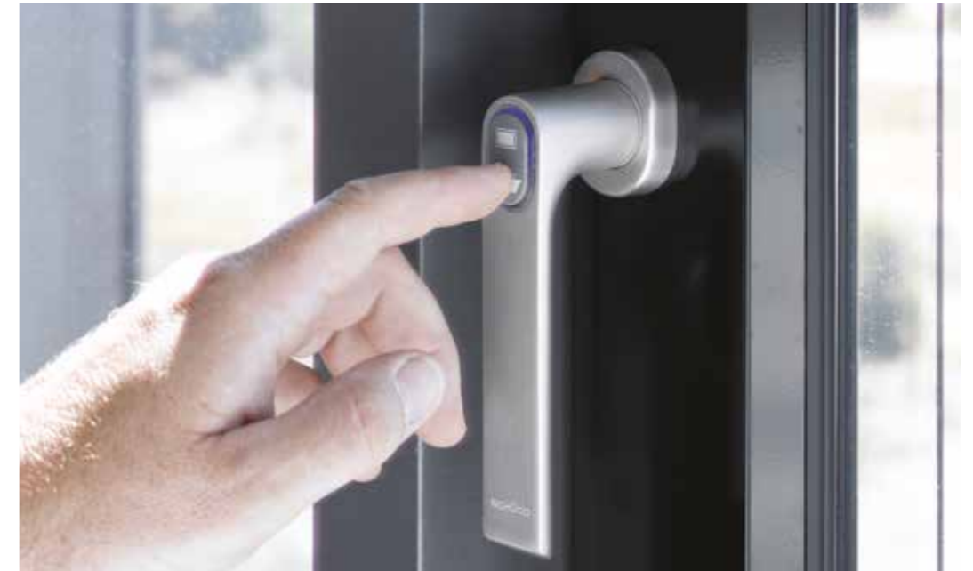
Automation at the touch of a button