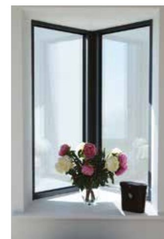
Every window makes a statement

We all know how important windows are to the look of a home and with The Schueco Contemporary Living Collection, it's never been easier to get these right.