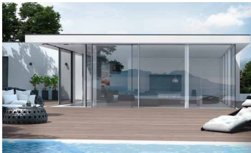
A stylish and contemporary look, courtesy of Schueco

This means you can enjoy the drama of large-scale clear glazing, while still staying warm and comfortable on cold winter days.