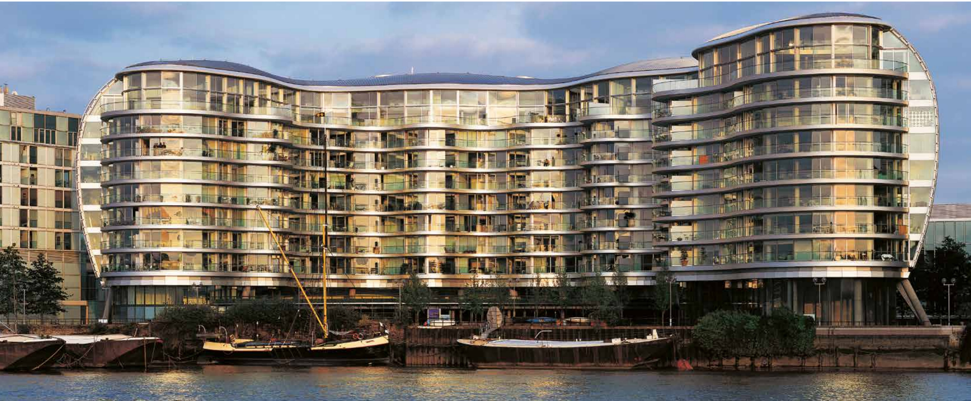
Albion Riverside, London, designed by international architect Foster + Partners and featuring Schueco systems

The systems we produce for the residential market are only one part of our business. Founded in Bielefeld, Germany, in 1951, we are a global company responsible for the aluminium façades, windows and doors on many of the world's most prestigious buildings.