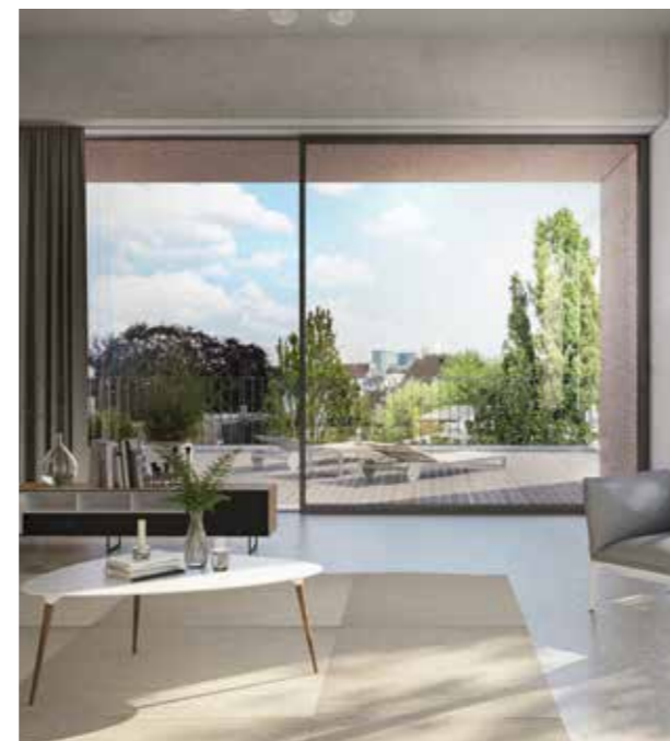
Slide a Schueco door open to enjoy more than the view