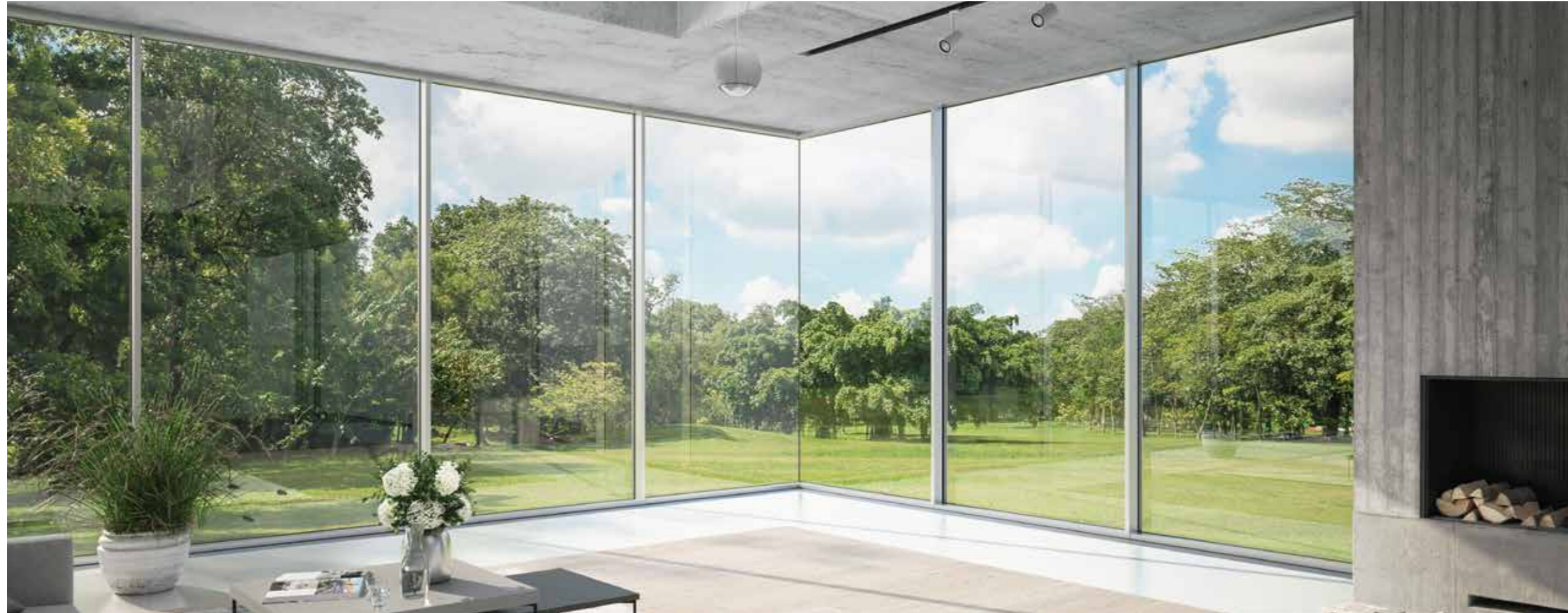
Narrow face-widths and a glass-to-glass corner: only a Schueco façade can offer this level of sophistication

As components in a building, aluminium and glass complement each other perfectly.