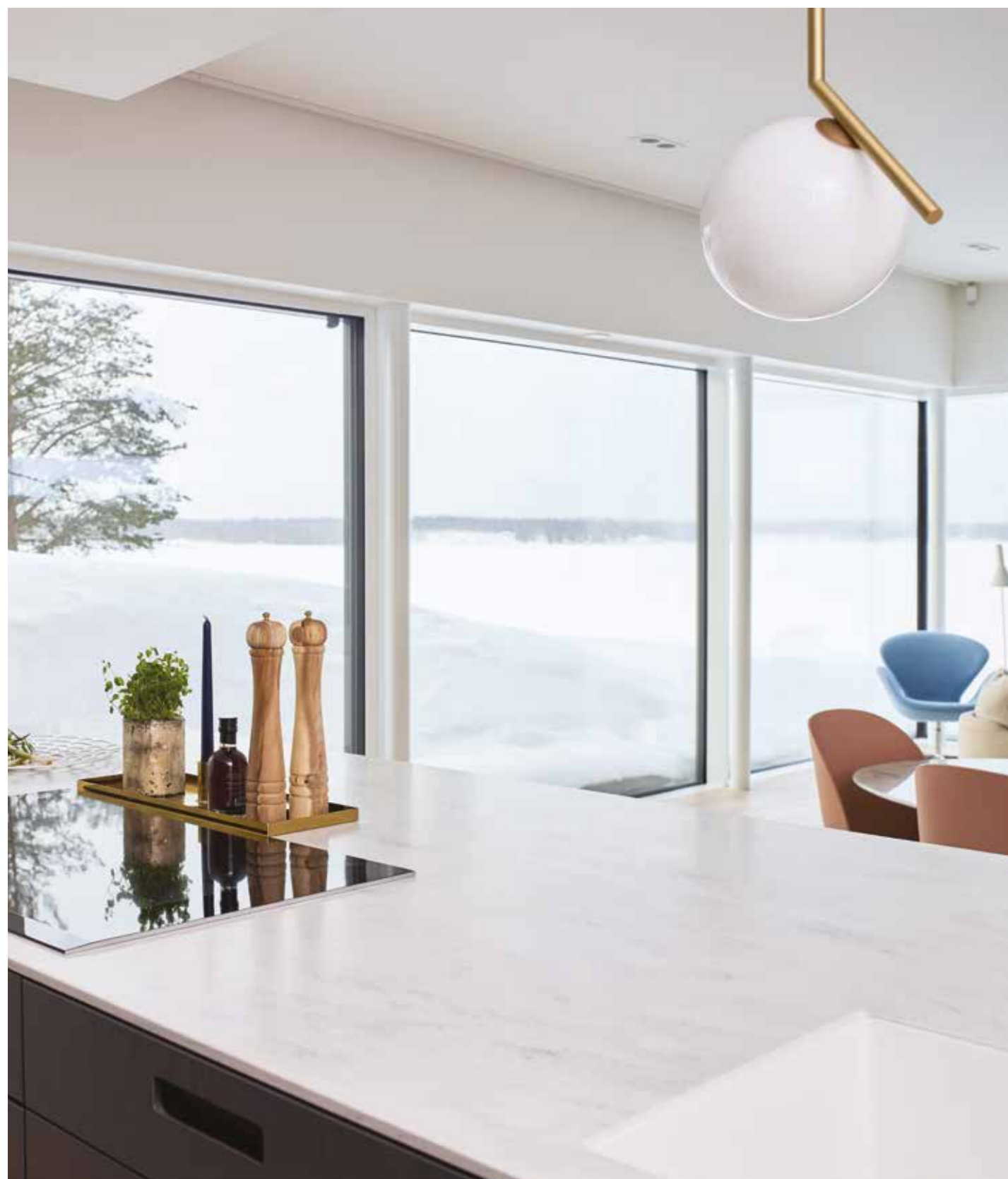
Excellent thermal insulation means you'll always stay warm when it's cold outside