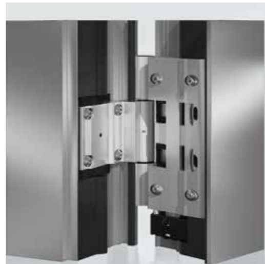
Completely concealed door hinges also offer excellent weather protection

Today's world is anything but certain, so one of our priorities is to ensure that your home always feels safe and secure.