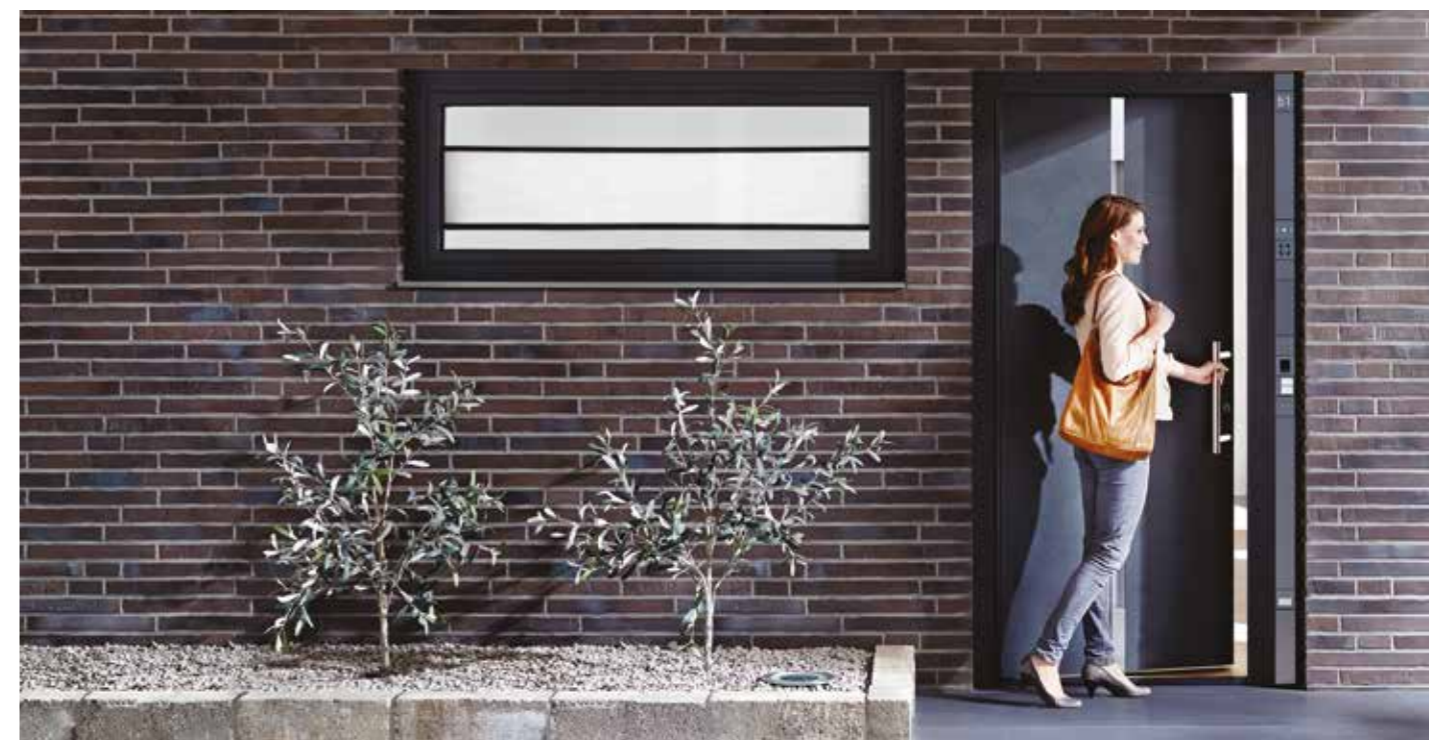
Customise your Schueco entrance door with stylish infill panels

When you visit someone's home, the front door is something you tend to use and forget. Yet its several active roles – as a barrier against the weather, as a guarantor of our security, as an indicator of our taste in design – make it an important feature.