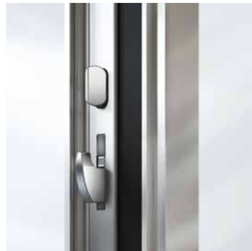
Multi-point locking: the ultimate security option