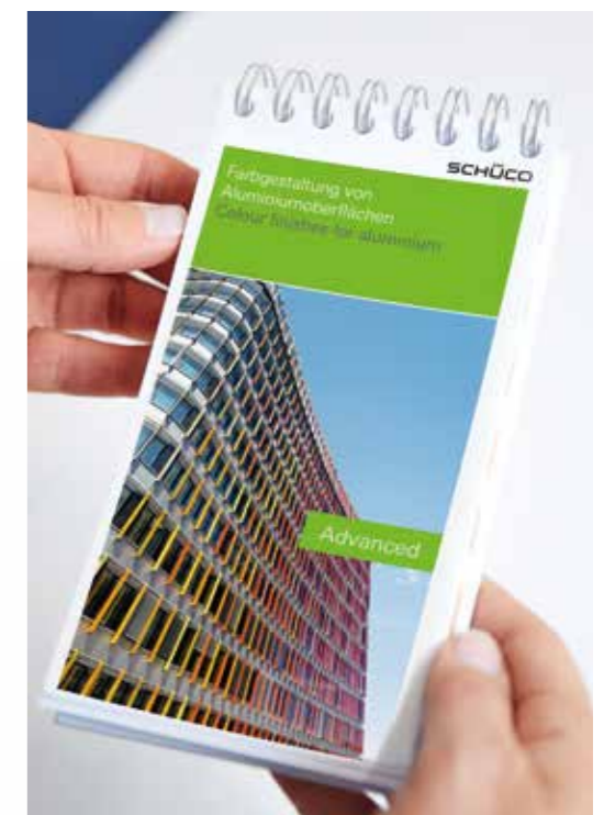
Real choice from the Schueco range of colours and finishes