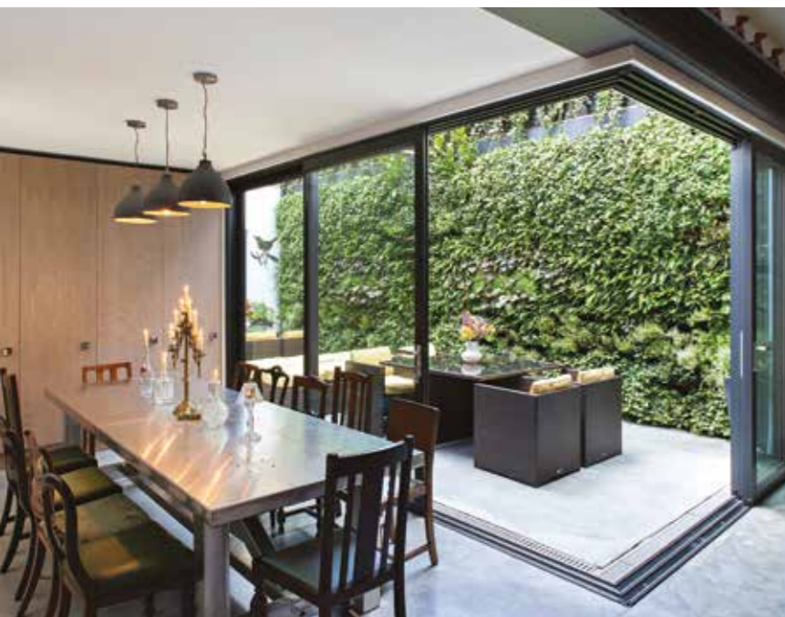
Schueco sliding doors without a corner post open up even more space