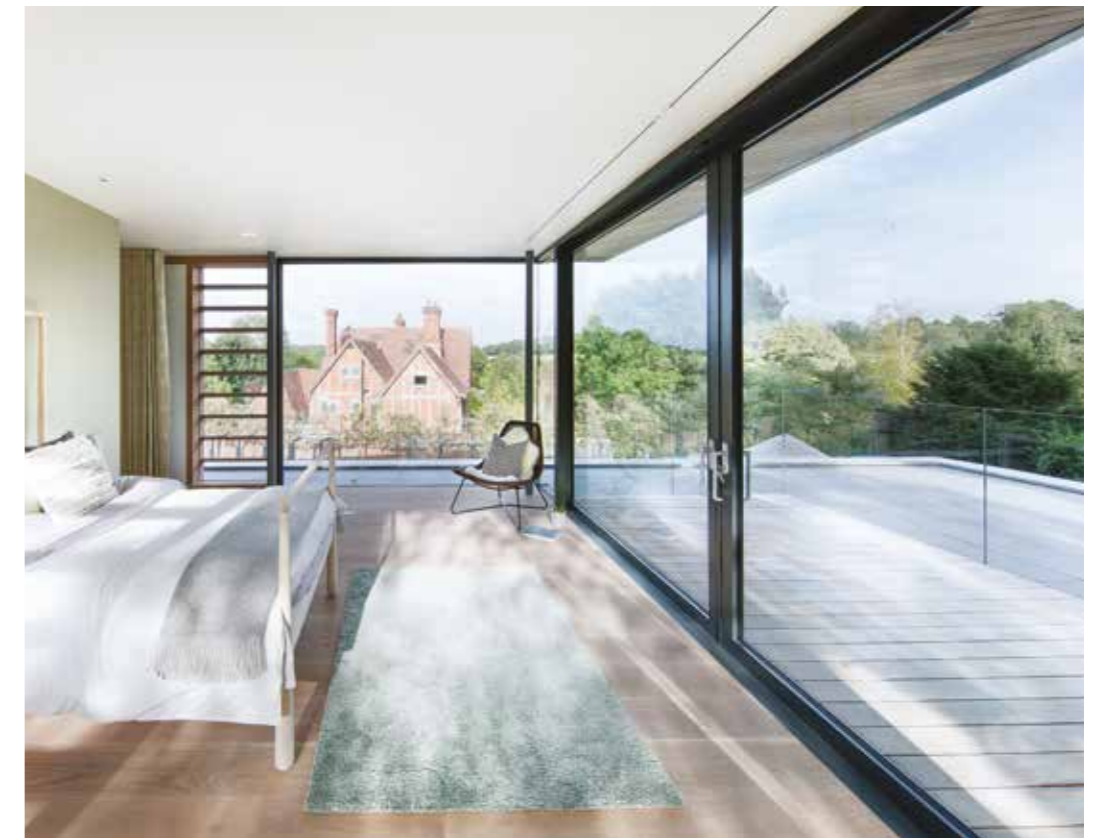
A Schueco highly-insulated sliding door means maximum comfort