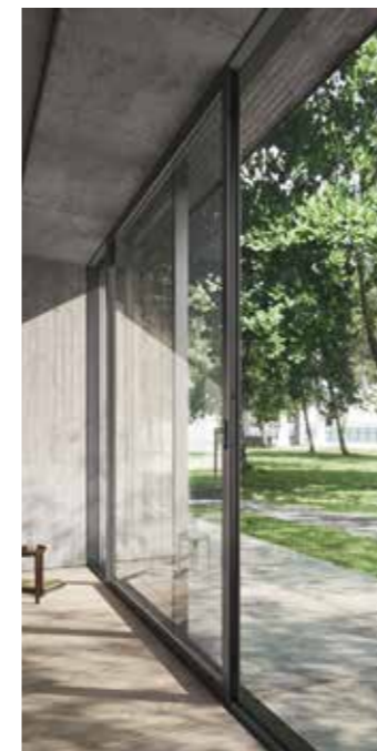
A Schueco lift-slide door has a low threshold

The moment you open a Schueco sliding door – whether it’s a straight slide or lift-slide – the solid feel of the frame and the easy-glide action make it clear you’re dealing with quality.