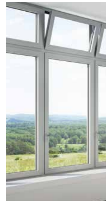
No more stretching to open fanlights