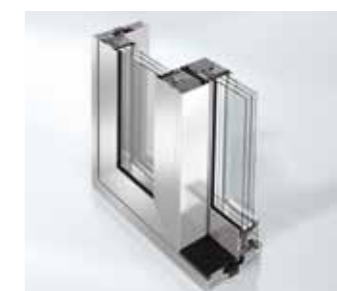
Schueco ASS 70.HI sliding door

And this not only means greater comfort and lower fuel bills, it also allows your home to do its bit for the environment by cutting the levels of CO 2 .