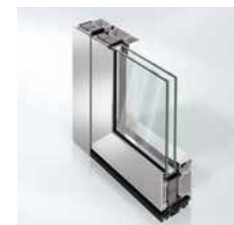
Schueco ADS 75.SI entrance door