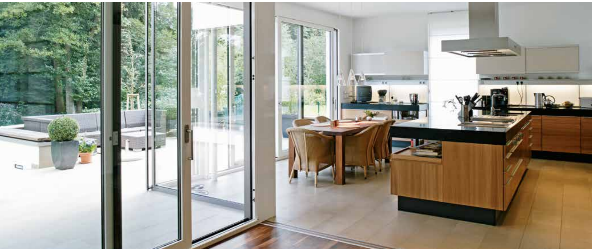
Let a Schueco sliding door bring light into your life