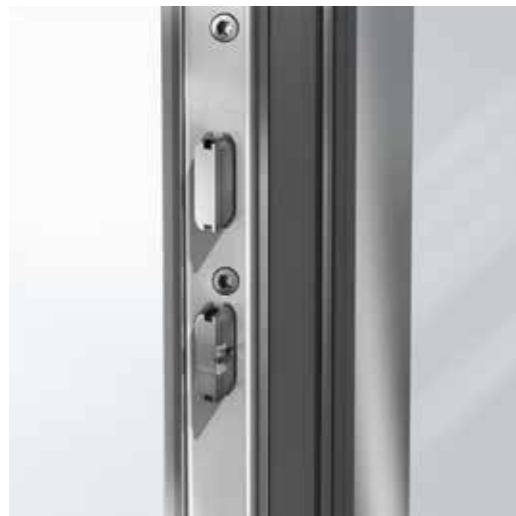
Schueco SafeMatic lock offers convenience and security