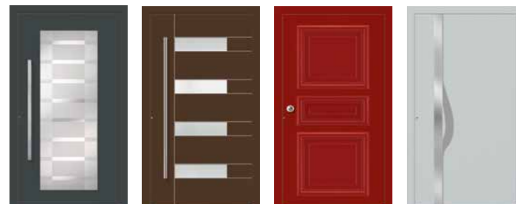
Some of the design options available to you

In short, a Schueco door is a perfect union of form and function, meeting the highest standards of design and comfort.