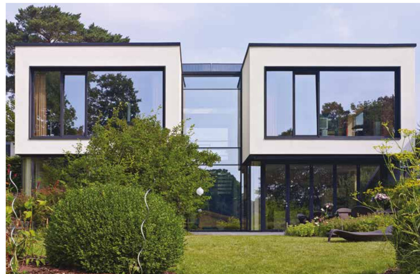
Perfectly proportioned windows enhance architectural brilliance