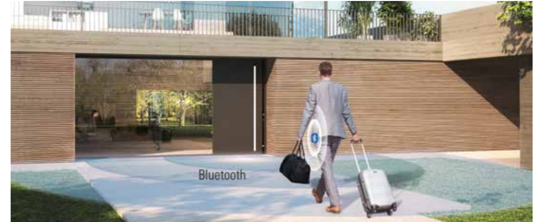
Schueco BlueCon unlocks the door automatically from a distance of 4 metres

The ultimate in domestic luxury, Schueco's TipTronic mechatronic window opening system is an option you may find hard to resist.