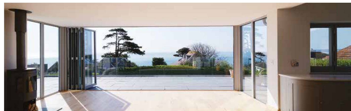
Have complete access to your terrace