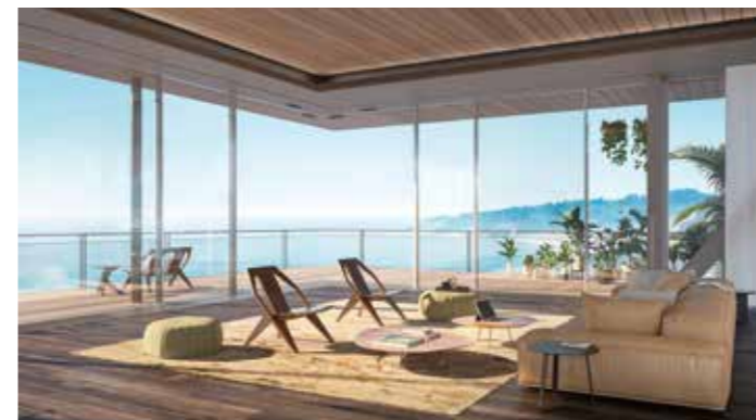
A completely open corner allows a clear view