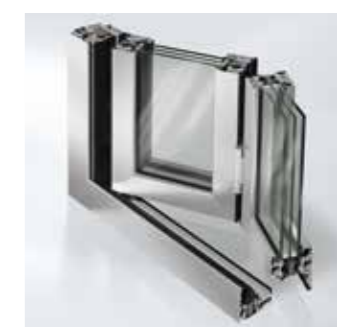
Schueco ASS 80 FD.HI folding door with triple-glazing