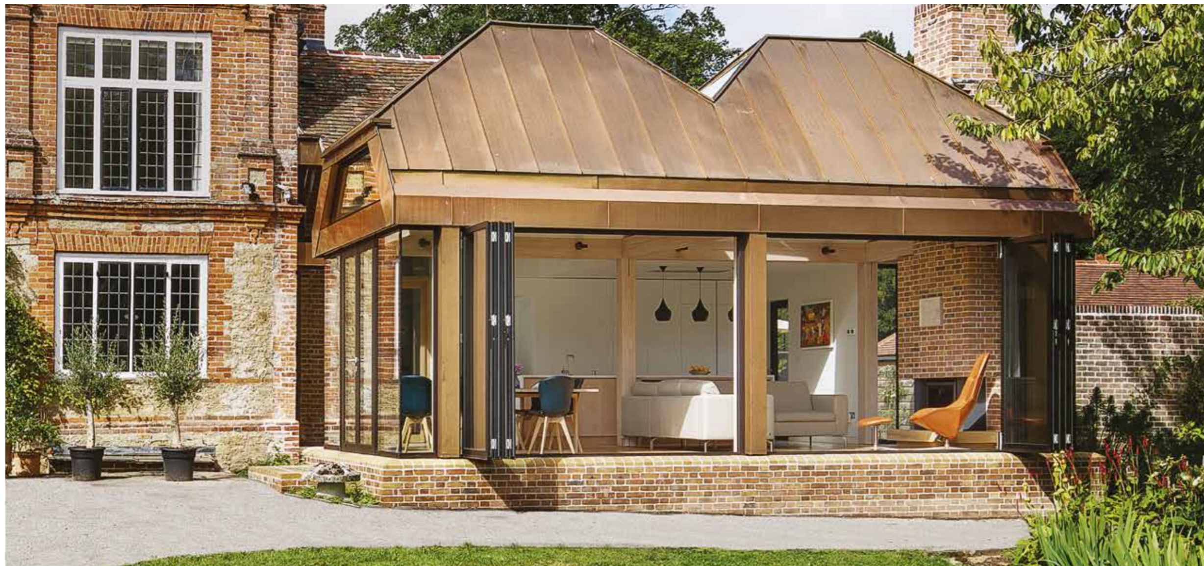
Enjoy a fabulous open air experience

Everyone loves being in the open air when the sun shines.