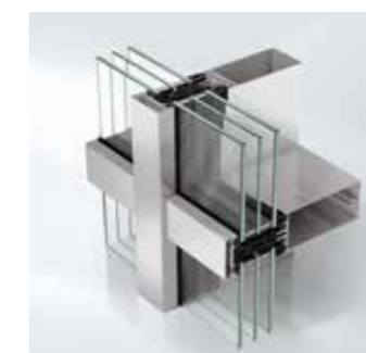
Schueco FW 50*.SI façade