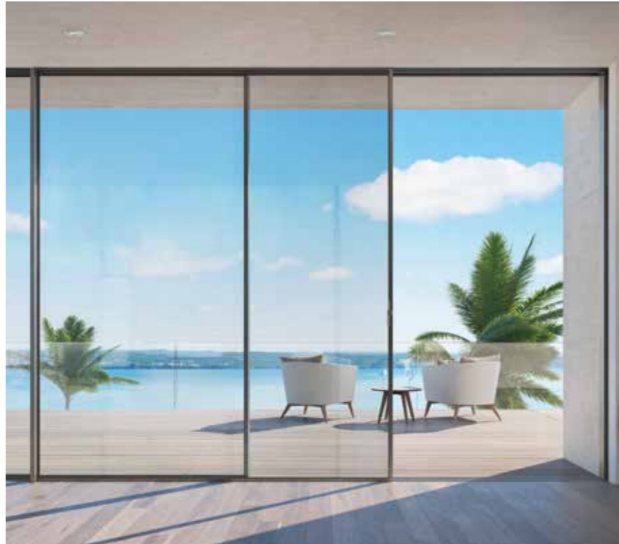
A panoramic sliding door lets you see the bigger picture

What's the best way to bring a house to life? Answer: flood it with light.