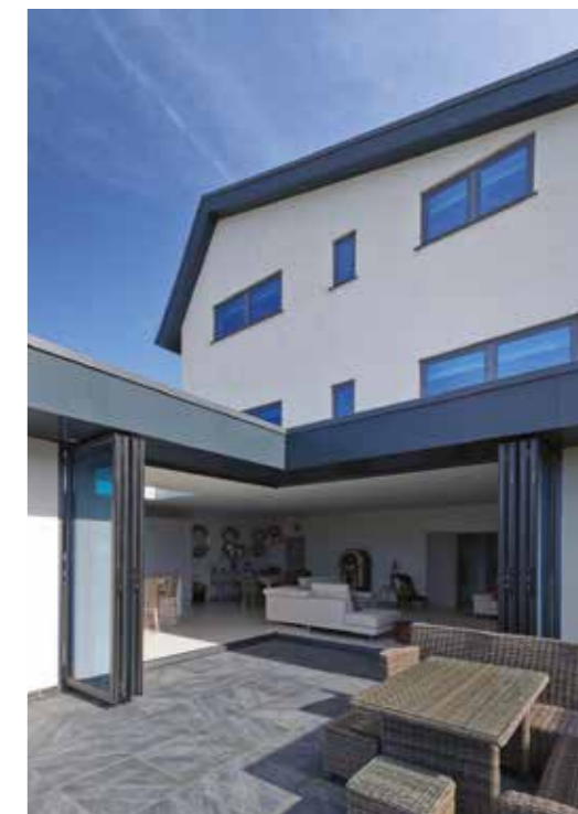
Without a corner post you can open up your entire patio

In addition, being highly engineered and equipped with a multi-point locking mechanism, a Schueco folding door is exceptionally strong and dependably secure, despite its elegantly slim frames and narrow face-widths.