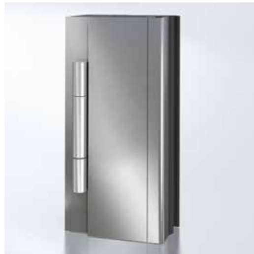
Slim-line barrel hinges with concealed fixings merge seamlessly into the profile