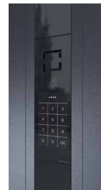
Keyless security access