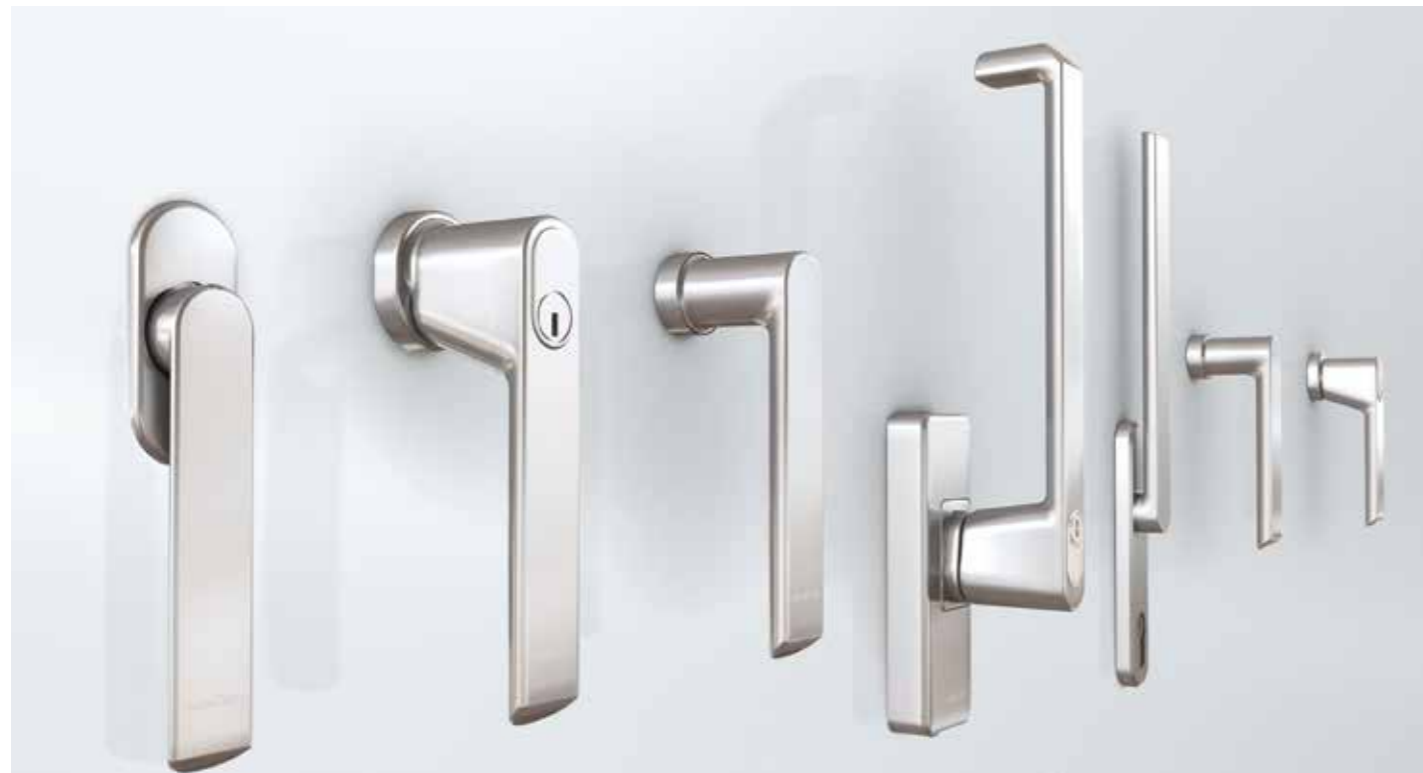
Minimalist design and a range of finishes give Schueco handles for windows and sliding doors their timeless appeal