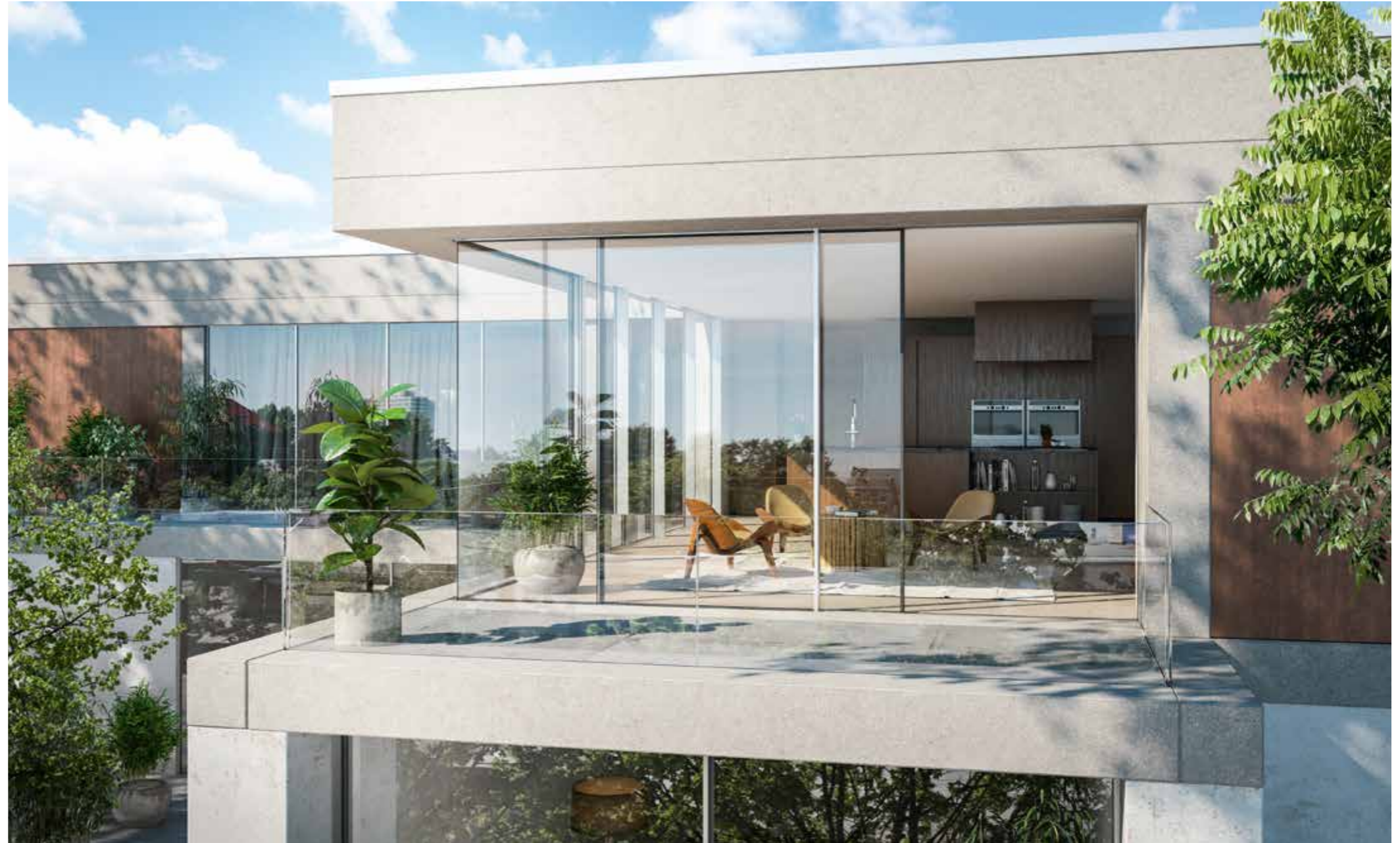
Panoramic sliding doors are your window on the world

With access made particularly safe by a threshold which lies completely flush, these beautiful sliding doors are as functional and secure as they are stylish.