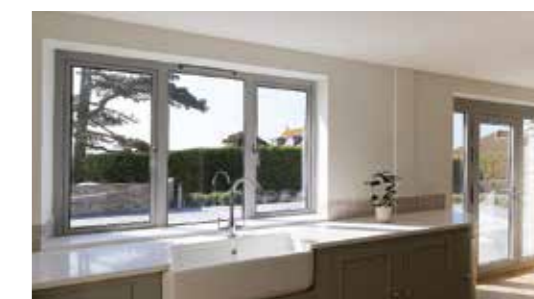
Form meets function, perfectly