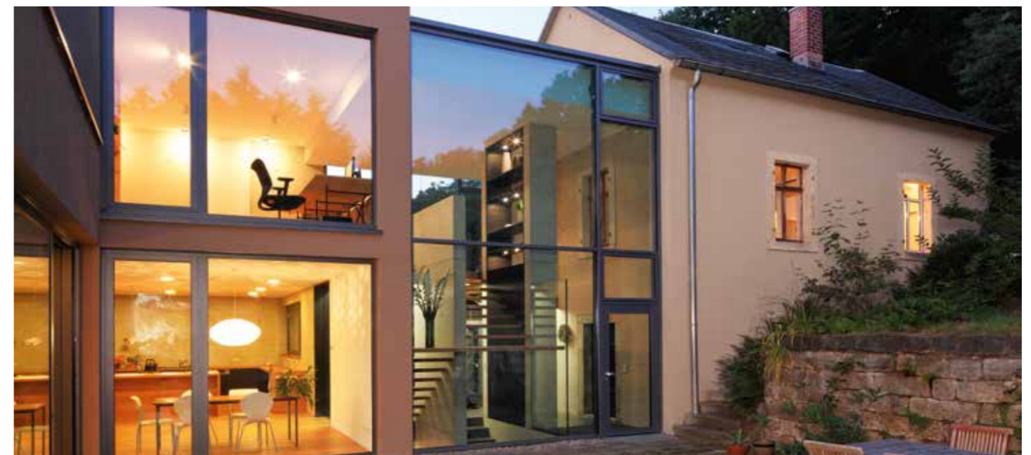
Schueco highly-insulated façades are just one design option