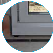
DuPont™ Froth-Pak™ 180