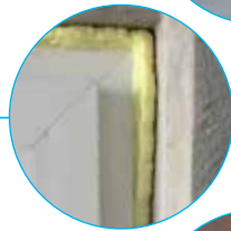
DuPont™ Insta Stik™ Flex+