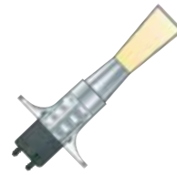
Art.-Nr. 259220 black/transparent