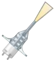
Art.-Nr. 259219 white/transparent