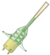
Art.-Nr. 259212 yellow/green