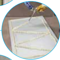
DuPont™ Insta Stik™ MP (FC)