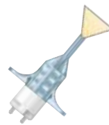
Art.-Nr. 259216 white/blue