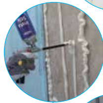
DuPont™ Insta Stik™ MP (FC)