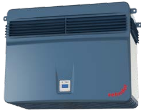
Zehnder CleanAir 6