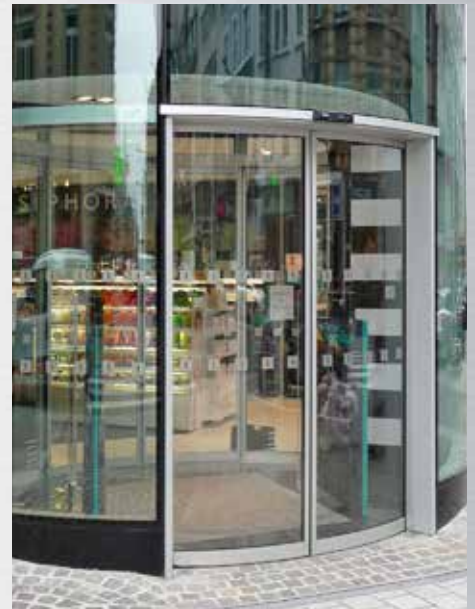
An elegant lightweight frame profile incorporated into a curved design