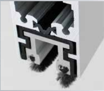
Profile cross-section with floor brushes