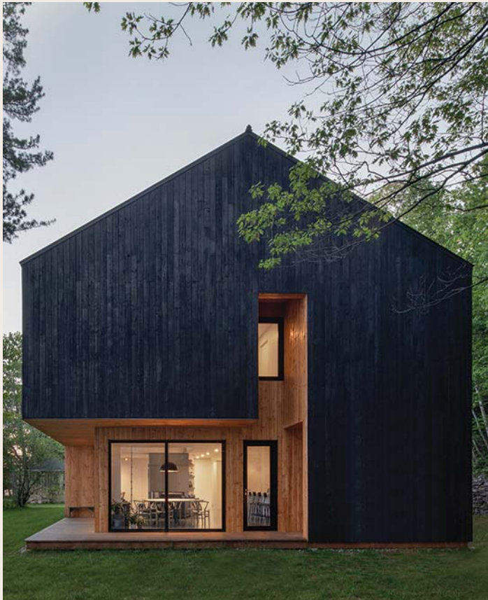
Atelier Schwimmer, schwimmerca