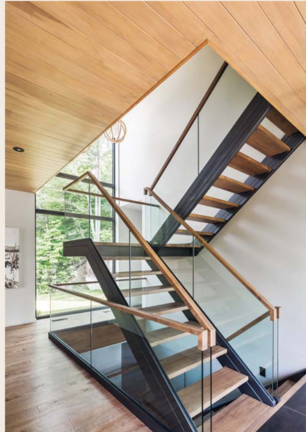
Residence L'Estrade-MU Architecture