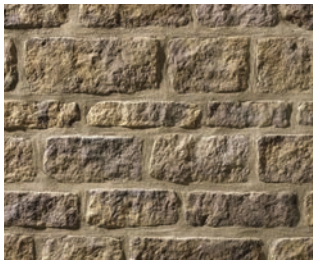
Rough Dressed Southwold