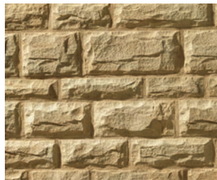
Square Dressed Buff