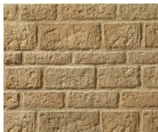
Traditional Buff Cotswold

PLEASE NOTE: All Bradstone products are manufactured/cut to order. Lead times vary between 4-8 weeks. Please contact us for confirmation of lead times when scheduling and ordering. Other colours are available to special order. Please see our website for table of sizes.