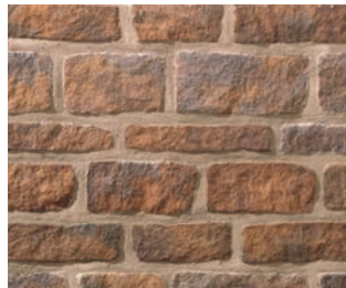
Rough Dressed Iron Ham