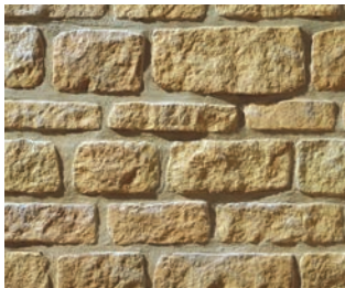
Rough Dressed Cotswold

The Bradstone range of reconstructed stone slips and corners are suitable for use in our panel systems. The Bradstone range is available in the following colours: