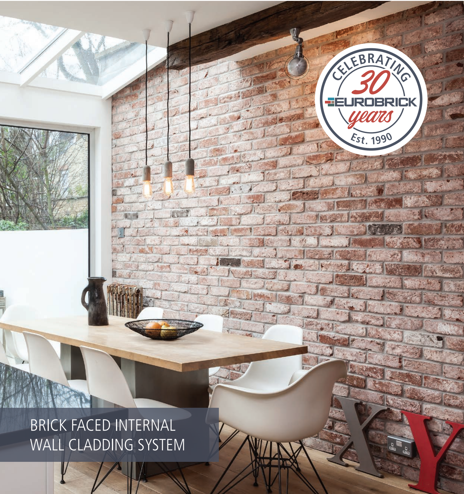
BRICK FACED INTERNAL WALL CLADDING SYSTEM