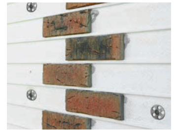
2. Brick slips are attached with permanent bonding adhesive.