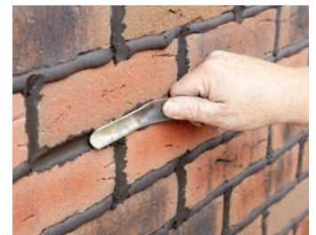
4. Mortar is tooled in the manner of traditional pointing.