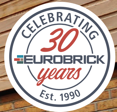
BRICK FACED EXTERNAL WALL CLADDING SYSTEM