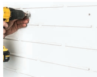
1. The ribbed backing panel is fixed to the substrate.

NB. Additional detail diagrams are available on our website or please refer to our Installation Guide. Please note that failure to fix in accordance with Eurobrick's instructions will invalidate the product guarantee.