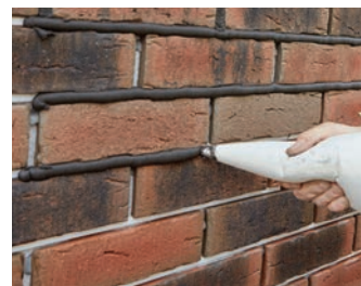
3. Specially formulated mortar is then piped into the brick joints.