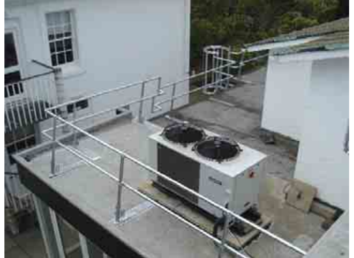
The system can be designed to accommodate various roof profiles and air conditioning plant.

The Shorguard Guardrail system for temporary and permanent use was awarded the Sun Alliance International trophy for "Outstanding achievement in Occupational Risk Improvement".