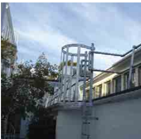
Cat ladder installation connection featuring guardrail return connection

This method uses cast 'T' pieces to connect the handrail tubes in the same plane as the vertical post.