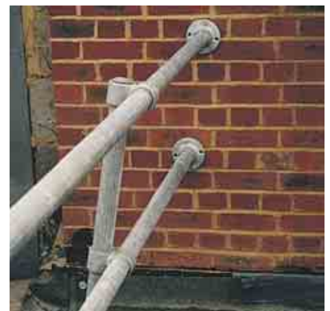
Wall Plate Fixing