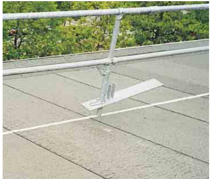
Full edge protection is maintained during refurbishment and repair work.