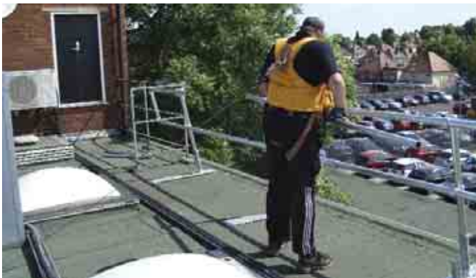
Final stage of guardrail installation.