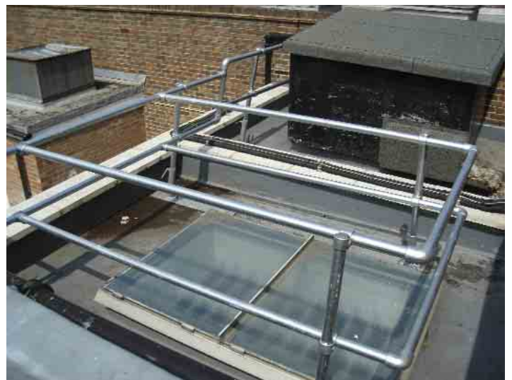
SG4 can be configured to guard rooflights.