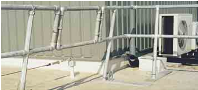
Safe access points can be formed within the system.