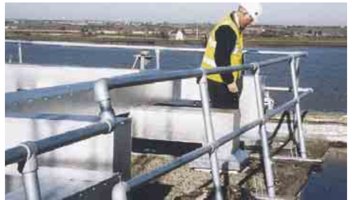
The galvanised system is ideal for use in aggressive and marine environments.