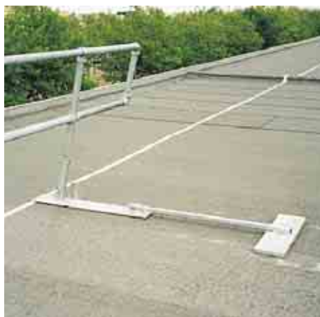
Stop End Shoe Extension