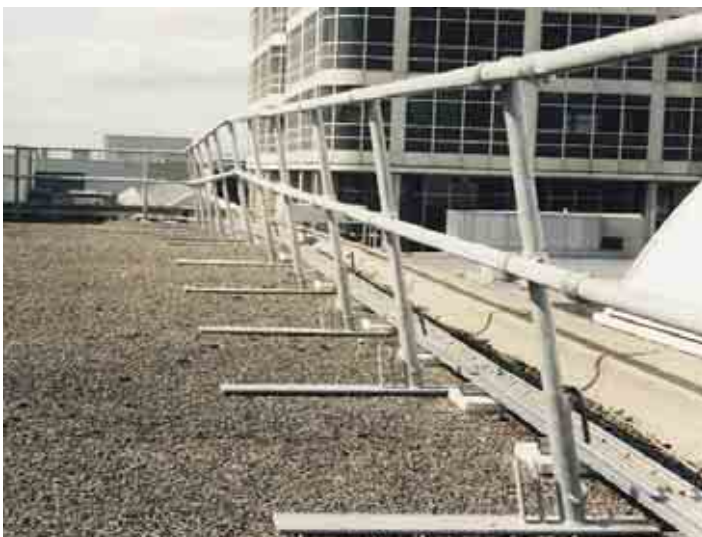
Variations to roof levels and pitches can be accommodated.