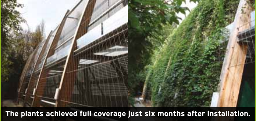
The plants achieved full coverage just six months after installation.

We supplied and installed a 550 square metre Jakob green wall, providing an excellent aesthetic solution as well as effective protection for the new building. Giving both shade and additional insulation, the system is delivering functional, cost and environmental benefits to the school.