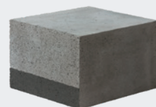
Foundation Block High Strength Grade