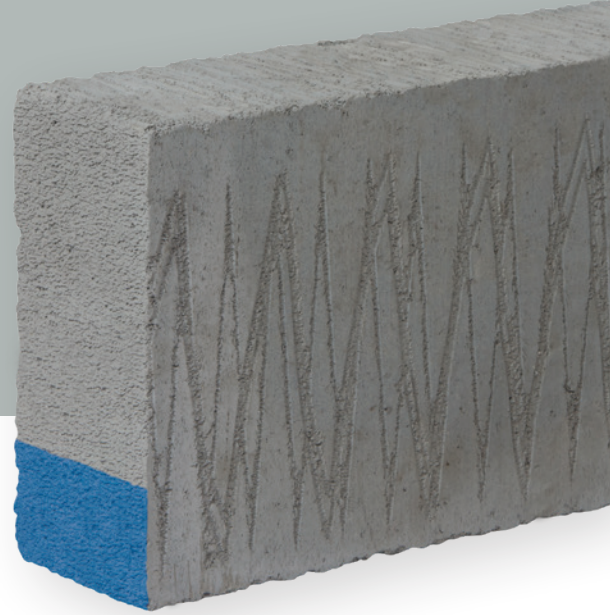
Solar Grade (blue)

Solar Grade is principally used where enhanced thermal performance is required.