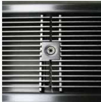
HG100 fine-linear grating cover