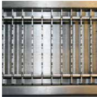
HG100 anti-slip ladder grating cover