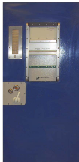
CellGuard® custody door