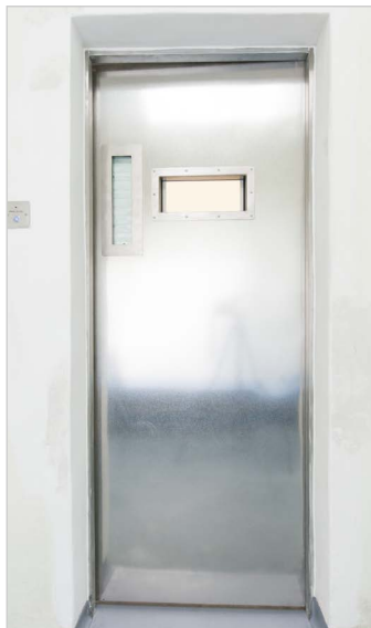
CellGuard® in situ

The Fendor CellGuard® custody door range encompasses: cell doors, perimeter doors and fire resistant doors. All of which are engineered and tested to withstand sustained levels of attack.