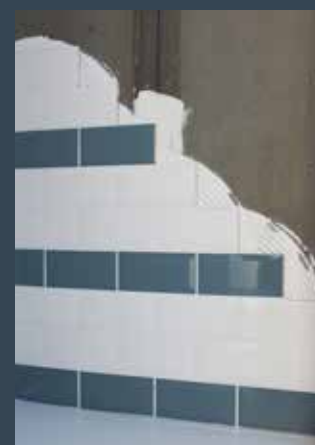
Simple installation and secure base for ceramic tiles