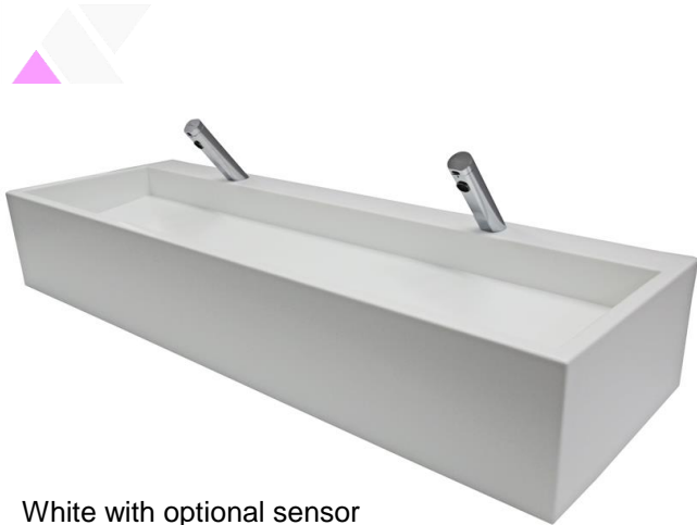
White with optional sensor operated spouts