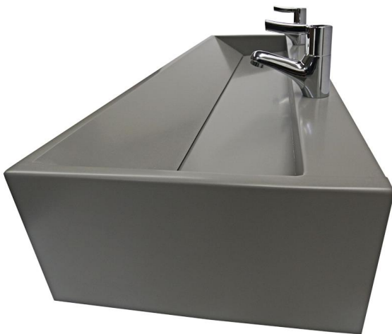
Grey with optional lever operated taps