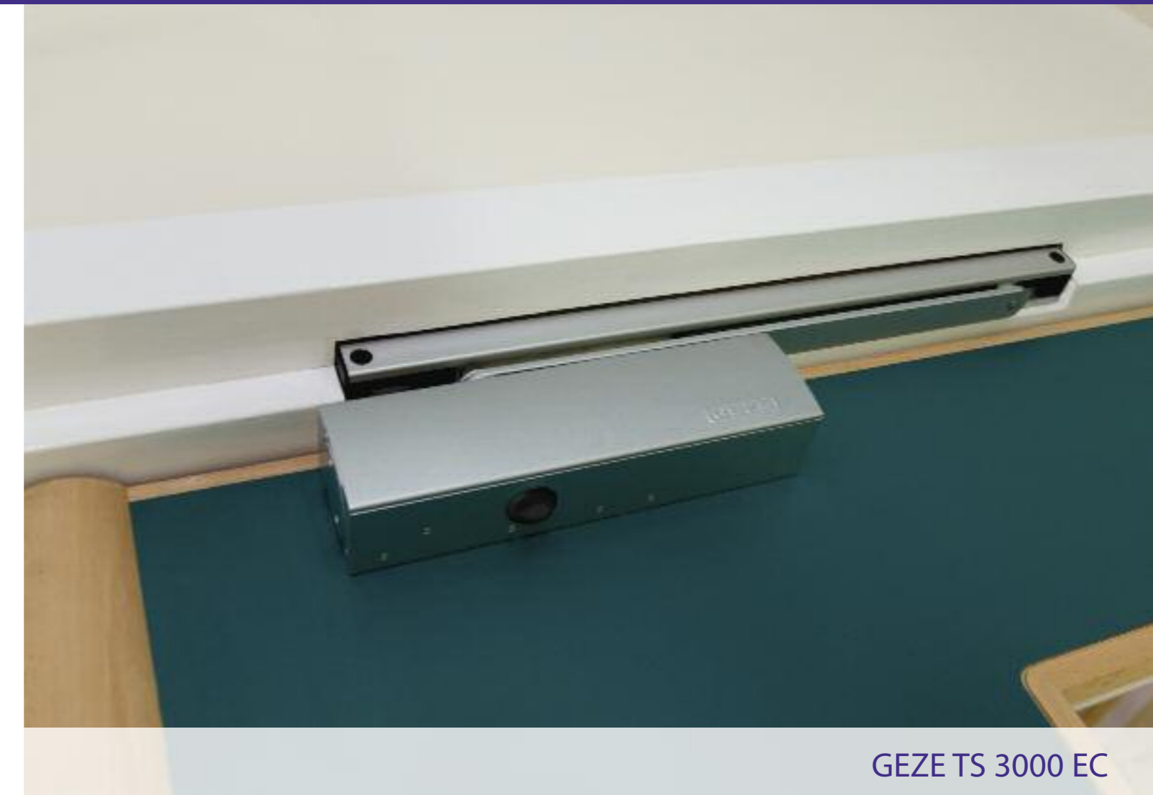
GEZE TS 3000 EC

Tel: 01543 443000 Fax: 01543 443001 Email: info.uk@geze.com Website: www.geze.co.uk