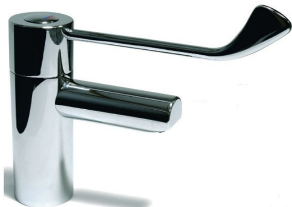
6753 LMMT-6 with 6" levers