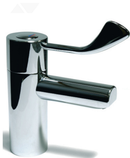
6753 LMMT with 3" levers