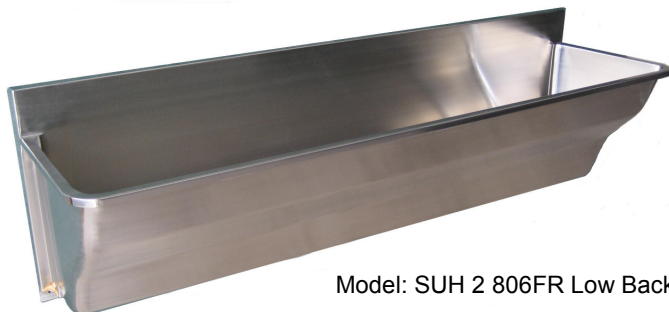
Model: SUH 2 806FR Low Back

The Economy version (right) is not HTM64 pattern but does meet the requirements of many installations. To provide a comparison, the illustration shows the same size and low back version as the HTM64 version above