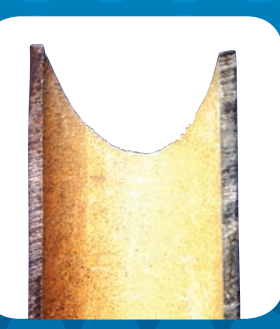
Galvanised pipe heavily corroded Combiphos protective layer