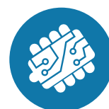
Multiple Product Power Supply