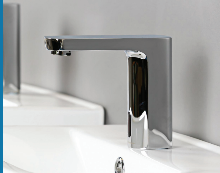
Vecta+ Sensor Tap

For more information, visit: www.cistermiser.co.uk/category/infrared-taps