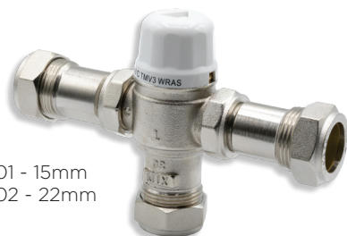
TMV1TMC101 - 15mm TMV1TMC102 - 22mm

For more information, visit: cistermiser.co.uk/category/tmv