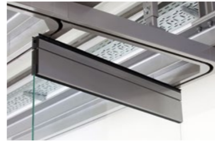
◀ HSW EASY Safe After being moved individually all panels stand in the park position. The dividing wall between inside and outside disappears.