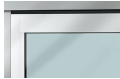
◀ HSW FLEX Therm Thermally insulated closure as desired. Weather and well-being alone decide whether the wall is open or closed.