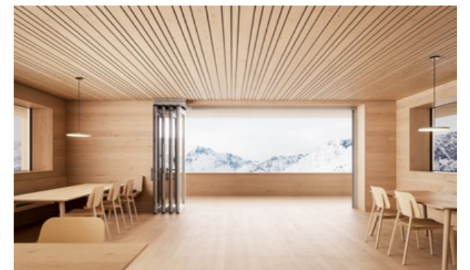
▲ HSW FLEX Therm Thermally insulated closure as desired. Weather and well-being alone decide whether the wall is open or closed.

Glass sliding wall systems leave room for creativity. Location, scope of application and desired indoor climate will determine the individual context for the individual project. The generous transparency reduces the visual separation between the interior and the exterior; a special advantage for shop fronts. And, if needed, the sliding panels make room for barrier-free openness.