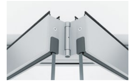
◀ FSW EASY Safe Ideal for linear layout