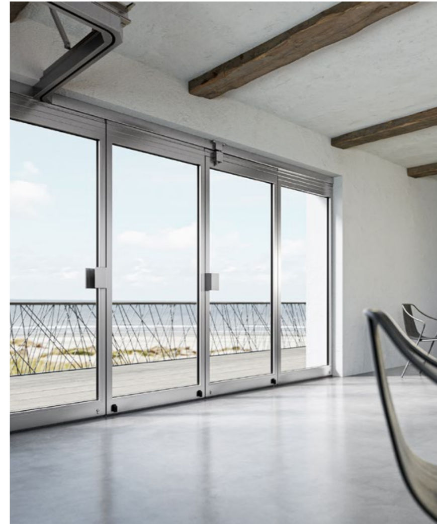
◀ HSW-R The fixed sliding panels quickly become hinged doors for access when the wall itself is closed.