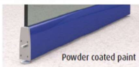
Powder coated paint

Anodised aluminium frame finish shown. Additional finishes are: