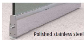
Polished stainless steel