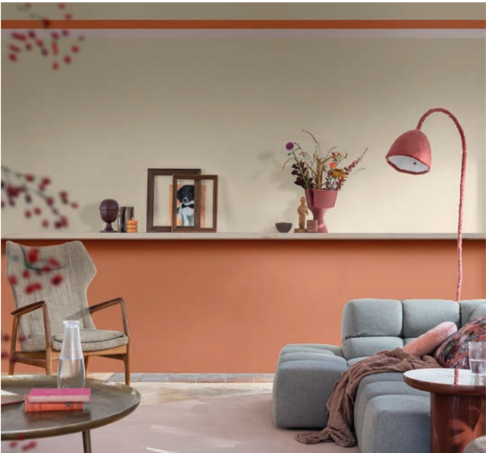
Cashmere Throw 30YY 51/098