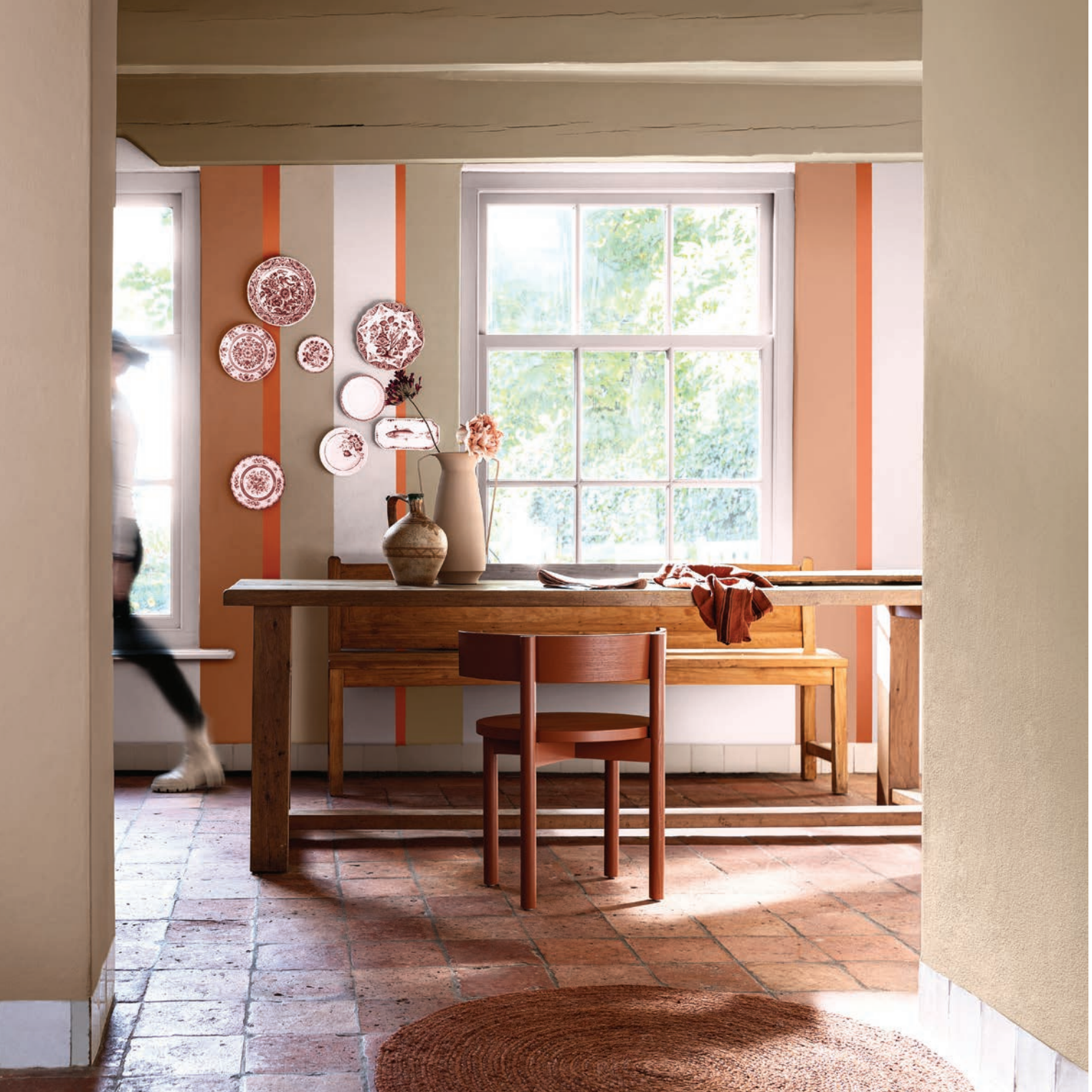
Cherished Ribbon 90YR 53/132