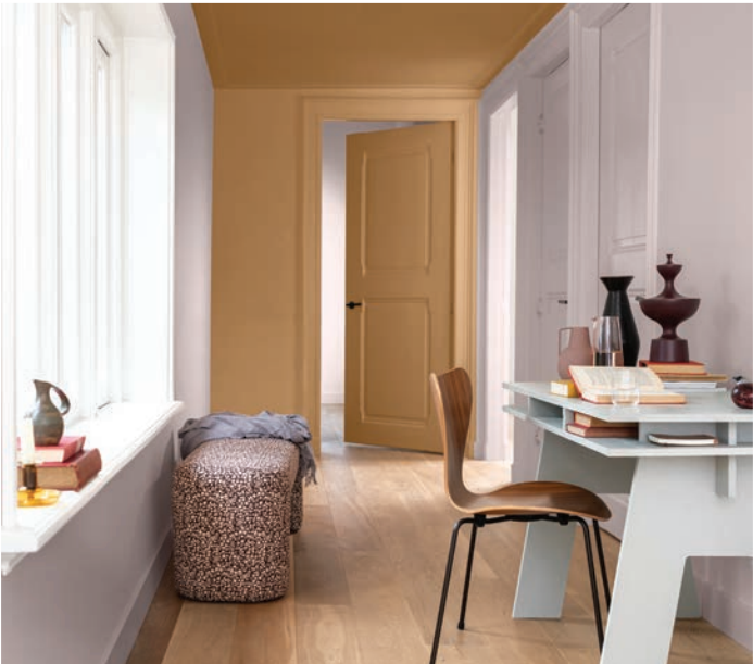
Sweet Embrace™ 70RR 64/034