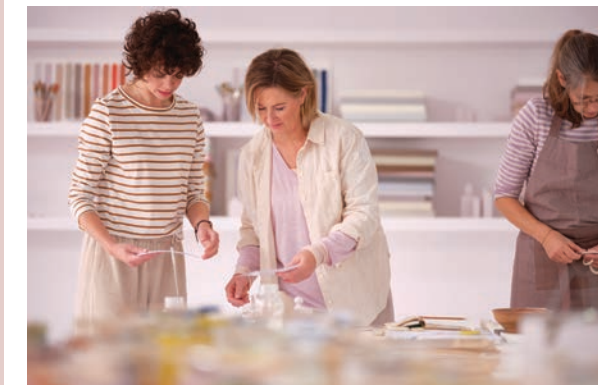
Above: Dulux Trade experts respond to international trends with cutting-edge colours that match the mood of the moment