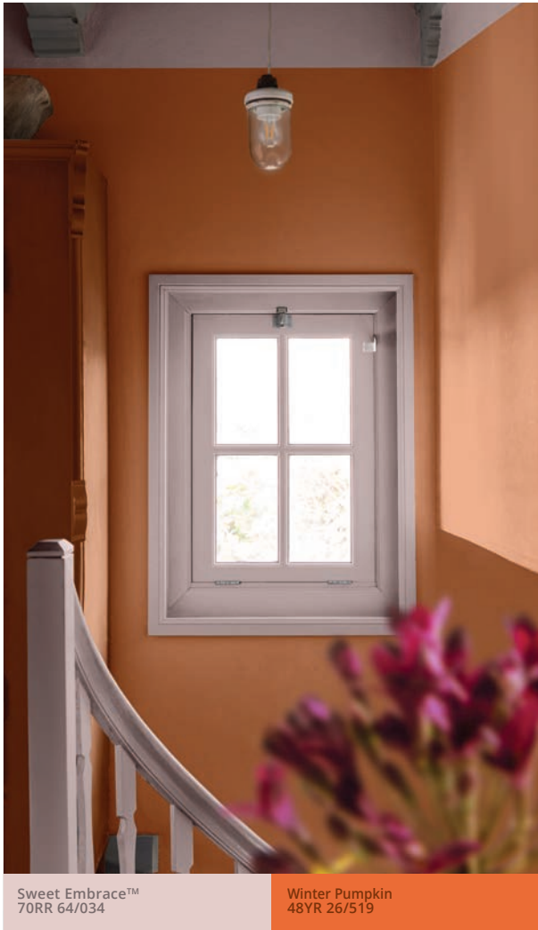
Sweet Embrace™ 70RR 64/034