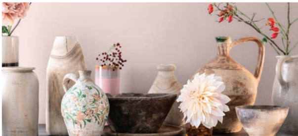
Sweet Embrace™ 70RR 64/034