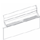
4 brick (300mm drop lead) IL4

Preformed leaded cavity tray system for new build