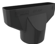
Plain Adapter RTV-ADP