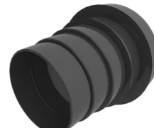
Multi Adapter RTV-ADMULTI