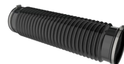
110mm Flexi-Pipe RTV-KIT1