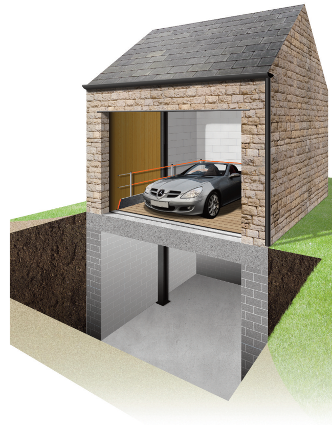
3. Door open, lift raised, 2nd car exits