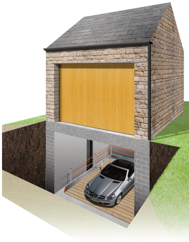
1. Door closed, lift lowered, 2nd vehicle below ground level