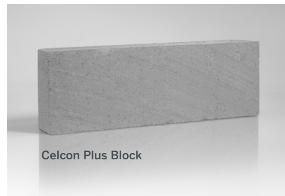
Celcon Plus Block