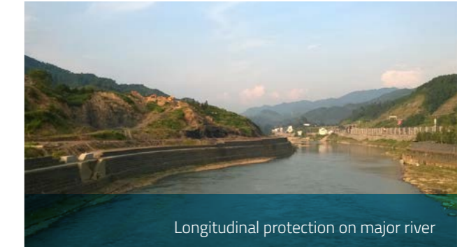
Longitudinal protection on major river

Our software is used to design channel protection and transverse structures. These enable the designer to rapidly perform preliminary hydraulic studies to evaluate the bank protection or the weir structure required.