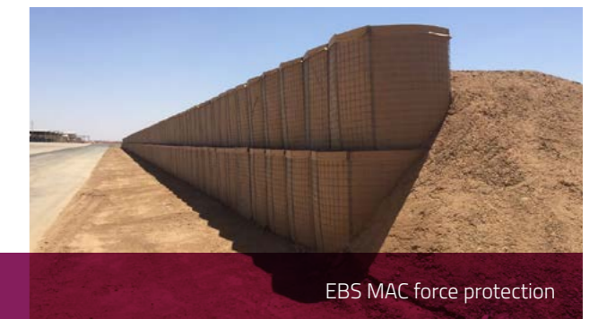
EBS MAC force protection