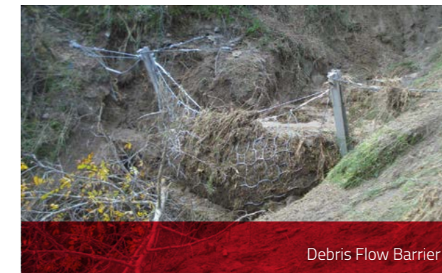
Debris Flow Barrier