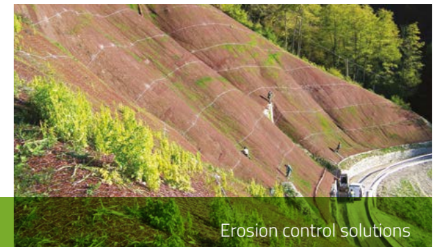
Erosion control solutions