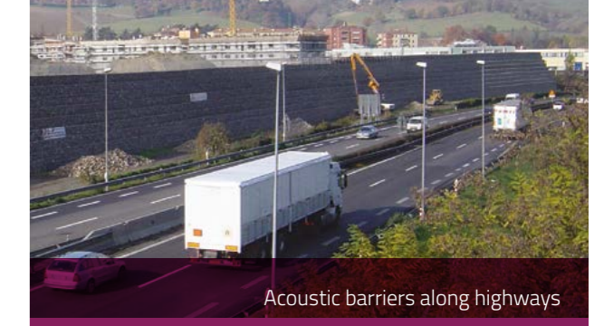
Acoustic barriers along highways