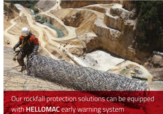
Our rockfall protection solutions can be equipped with HELLOMAC early warning system

Scalable to suit the hazard, embankments are used where large or repeated impacts are expected including landslides, rockfalls, and avalanches. Featuring reinforced soil technology, they can often re-use site won materials in their construction. Embankments can be designed to accept impact energy capacities of over 20,000kJ.