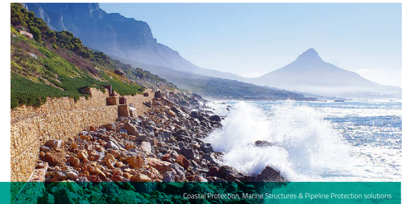
Coastal Protection, Marine Structures & Pipeline Protection solutions