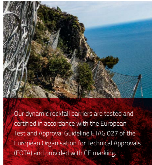
Our dynamic rockfall barriers are tested and certified in accordance with the European Test and Approval Guideline ETAG 027 of the European Organisation for Technical Approvals (EOTA) and provided with CE marking.