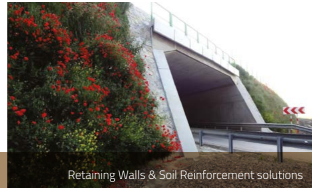
Retaining Walls & Soil Reinforcement solutions