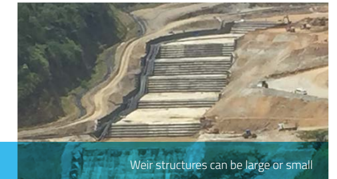
Weir structures can be large or small