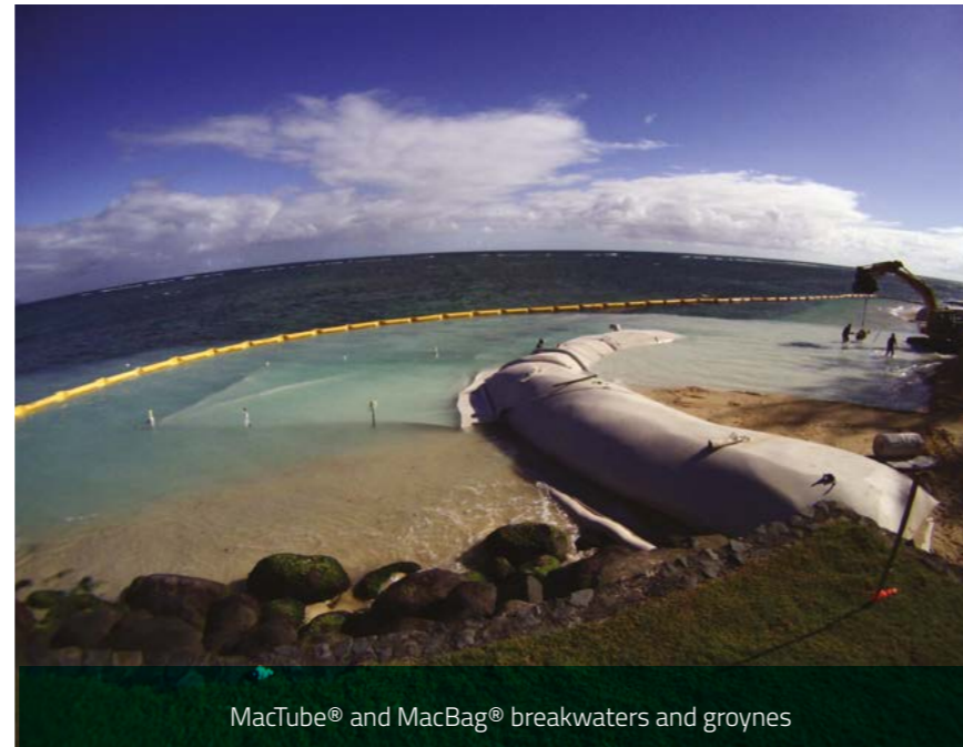
MacTube® and MacBag® breakwaters and groynes