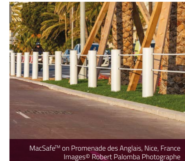
MacSafe™ on Promenade des Anglais, Nice, France