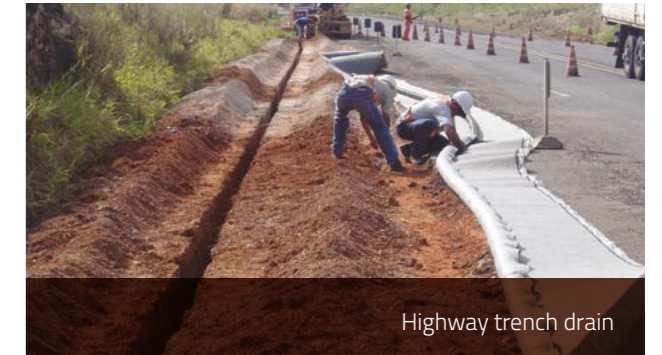
Highway trench drain

Our MacFLOW software resolves water-management challenges by enabling the design of the optimal MacDrain® drainage solution. The best value solution should not only address technical and economic issues, but also the environmental benefits and the speed and efficiency of installation.