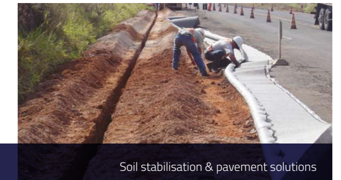
Soil stabilisation & pavement solutions