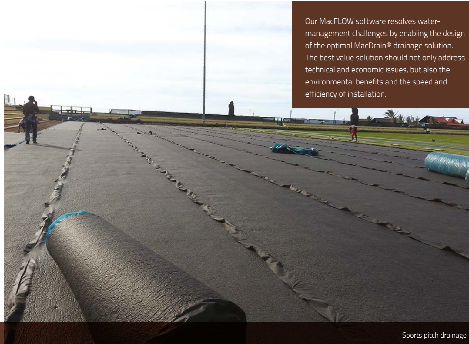
Sports pitch drainage

Our MacFLOW software resolves water-management challenges by enabling the design of the optimal MacDrain® drainage solution. The best value solution should not only address technical and economic issues, but also the environmental benefits and the speed and efficiency of installation.