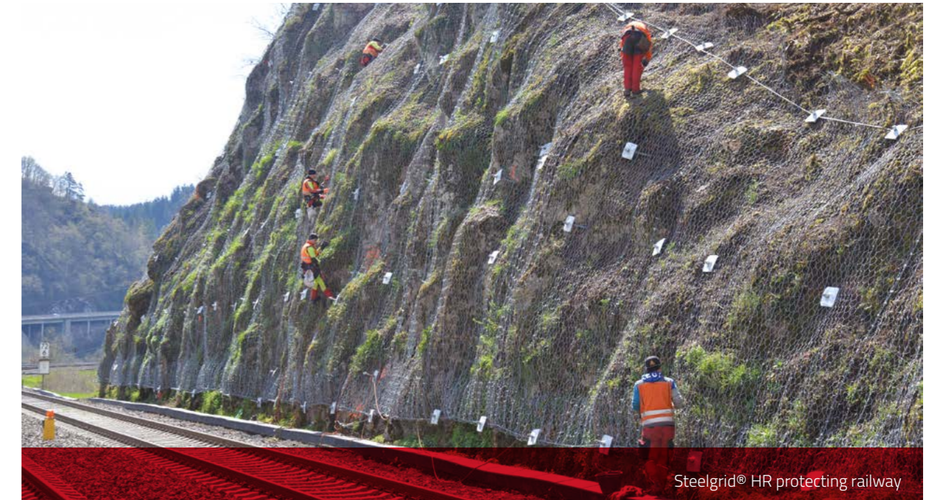
Steelgrid® HR protecting railway

A system of snow fence posts and anchors transmit forces from the snow pack into the ground.