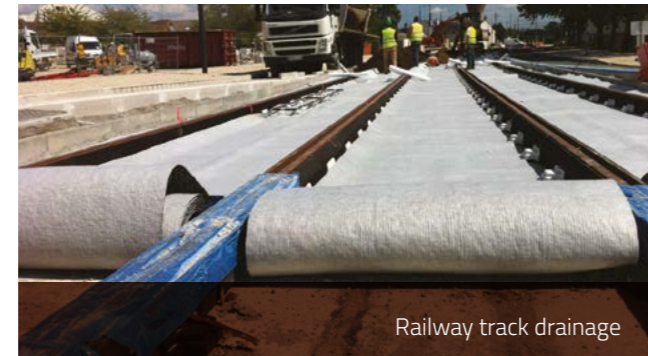
Railway track drainage

Effective drainage of the soils behind retaining structures, piled walls and within slopes is important to ensure the long-term performance of that asset. Lab-tested MacDrain® geocomposites offer reliable and long-term drainage capacity unlike gravel drains which can become clogged by fines in suspension within the ground water.