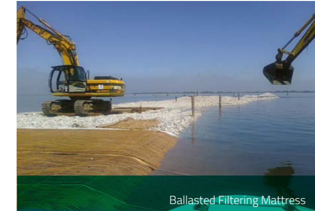
Ballasted Filtering Mattress