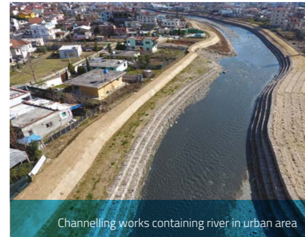
Channelling works containing river in urban area

Our MacLine® impermeable membranes and geosynthetic clay liners are often used to contain water within hydraulic works. They prevent water from draining away or cross-contaminating ground water. These geomembranes are often used in conjunction with our package of MacTex® geotextiles and MacDrain® drainage geocomposites.