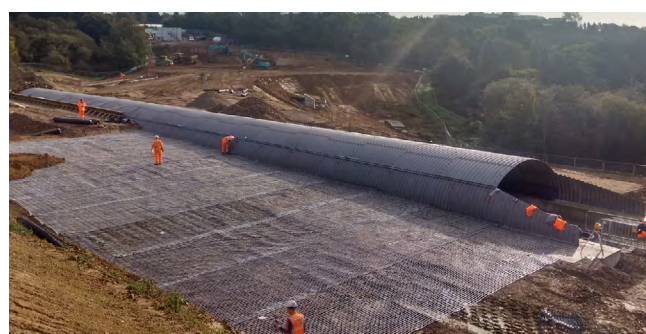
ParaDrain® reinforcing marginal soils