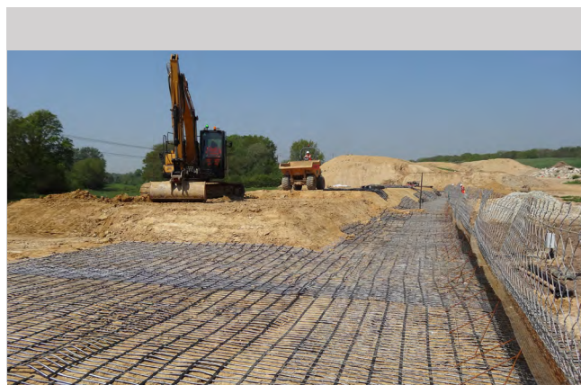
ParaDrain® used with Green Terramesh®