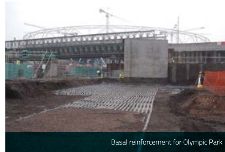
Basal reinforcement for Olympic Park