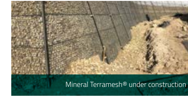
Mineral Terramesh® under construction