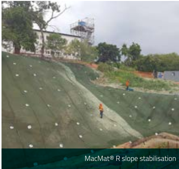
MacMat® R slope stabilisation

When introducing a layer of topsoil to a slope use GeoMac®. GeoMac® is an evolution of our Reno Mattress®. Lined with a geotextile filter fabric, it's in-filled with stone, layered with topsoil and seed, then covered in a biodegradable matting. Secured against a slope face, GeoMac® enables vegetation to establish.