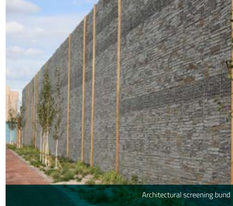
Architectural screening bund