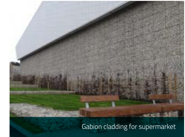
Gabion cladding for supermarket

Architects are increasingly specifying our stone-filled welded mesh gabions due to their pleasing aesthetics. Locally sourced rock blends into the surroundings giving a more natural appearance than traditional cladding systems.