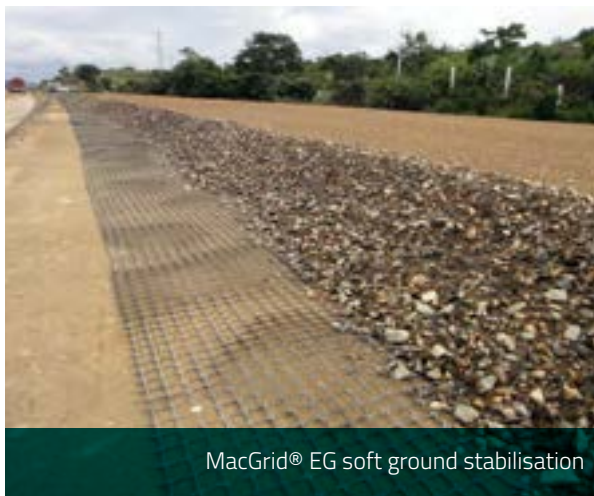
MacGrid® EG soft ground stabilisation