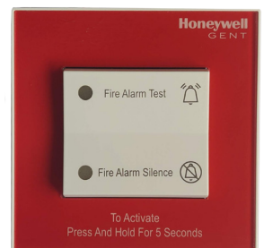
RED DOUBLE BUTTON