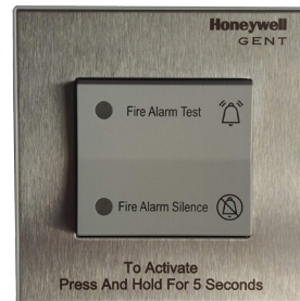
SILVER DOUBLE BUTTON