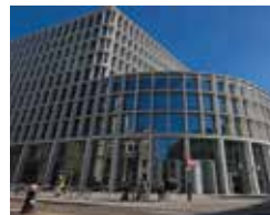
Commercial & Industrial