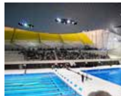
Sport & Leisure