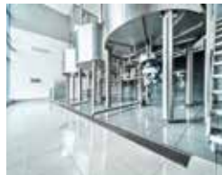
Food & Drink Manufacture

ACO Building Drainage specialises in the development and manufacture of high performance drainage systems for a wide range of sectors