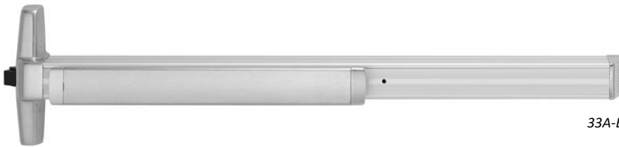
33A-EO Rim Latch Device

A fluid dampener decelerates the touch bar on its return stroke and eliminates most noise associated with exit device operations. Furnished on all 33A Series Exit Devices