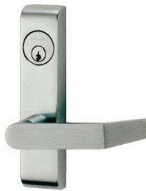
360L (06) Lever Trim