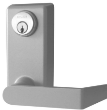
230L (06) Lever Trim