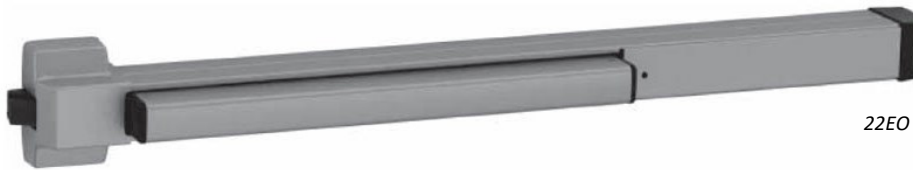
22EO Rim Latch Device

Designed specifically for use in areas where frequent abusive treatment can be expected.