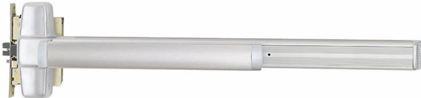
9975EO Mortice Lock Device

Best suited to heavy duty situations on perimeter and internal doors where architectural grade safe egress in panic emergency situations is a requirement.