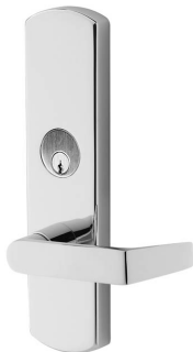
996L (06) Lever Trim