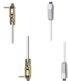
Concealed & Surface Rods & Latches