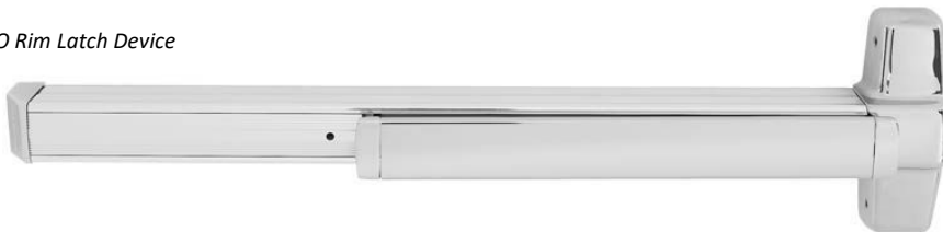
98EO Rim Latch Device