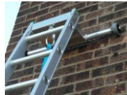
FIG 1. Roller wheels

Roll the Ladder up the wall into position with the roller wheels. FIG 1. Always erect using the 4:1 rule.