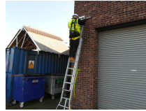
FIG 2. Ascended the Ladder

Having ascended the Ladder FIG 2 . Attach your Harness or safety belt (Not Supplied) to the underside of the tool tray using a short (half metre) Lanyard. NOTE: This is designed purely as a restraining device to prevent the user from over reaching which is a major cause of Ladder accidents.