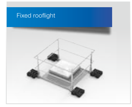
Standard fencing for rooflights with a skylight function.