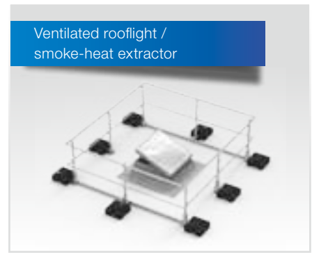
Variable sizes with sufficient free space for opening rooflights and smoke-heat extractors.