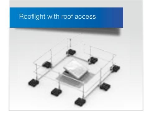
Self-closing gate for securing rooflights with an exit function.