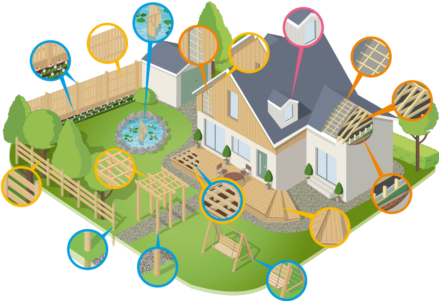
The illustration above shows the wide range of end uses for various timber Use Classes.