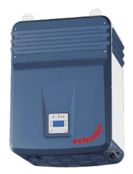
Zehnder CleanAir 2