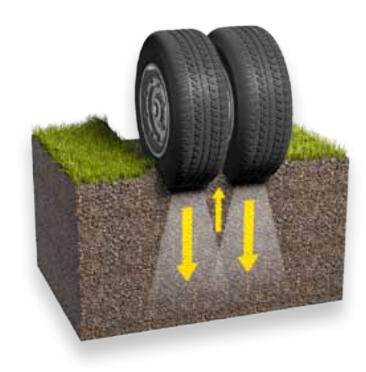
Without the Advanced Turf® system rutting can occur as loads are not distributed efficiently through the soils.