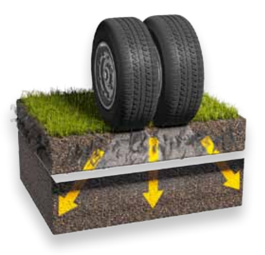
With Advanced Turf® system rutting is mitigated as the loads are distributed with greater efficiently through the soils.