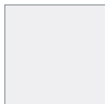
150 x 150mm Field

Beatrice is available in two sizes , perfectly designed for seamless installation.